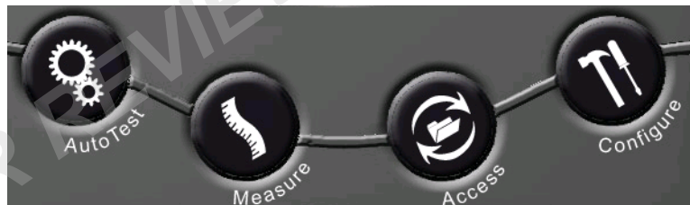
Figure 1 DSAM Mode Keys

Use the mode keys ( Figure 1 ) to directly access the top level menu of features associated with each mode.