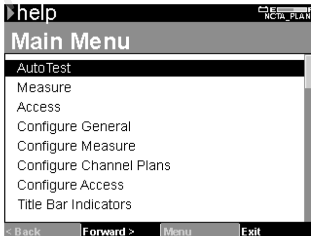
Figure 4 Help System Main Menu

Use the Help screen softkeys (Figure 3) to move Forward to the highlighted menu selection or Back to the last-viewed Help screen. The Exit softkey returns you to the beginning of the last active mode, and the Menu softkey displays the Help main menu (Figure 4).