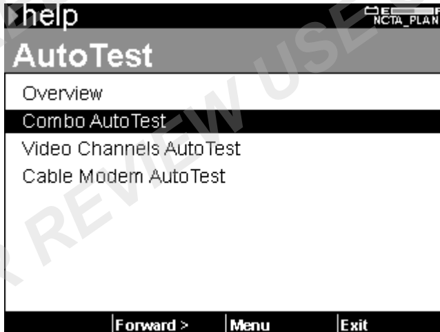
Figure 2 Help Menu for AutoTest Mode

When you access the Help system from one of the mode menus (such as AutoTest or Measure), the DSAM displays a mode-level Help menu that allows you to select the general topic you would like to learn about within that mode (Figure 2). When you use the arrow keys to choose a topic and press ENTER , the Help submode menu for that topic is displayed (Figure 3 on page 9). Use the arrow keys again to specify the Help text you would like to review and press ENTER to make your selection.