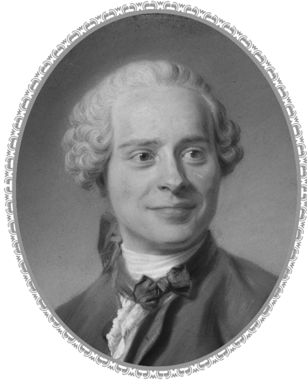
Jean Le Rond d'Alembert