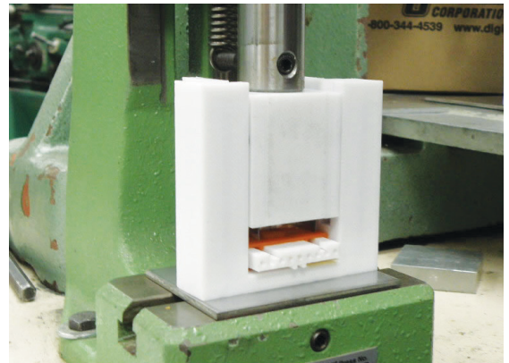
An operator at Xerox modified 350 connectors in about an hour on this toggle press.