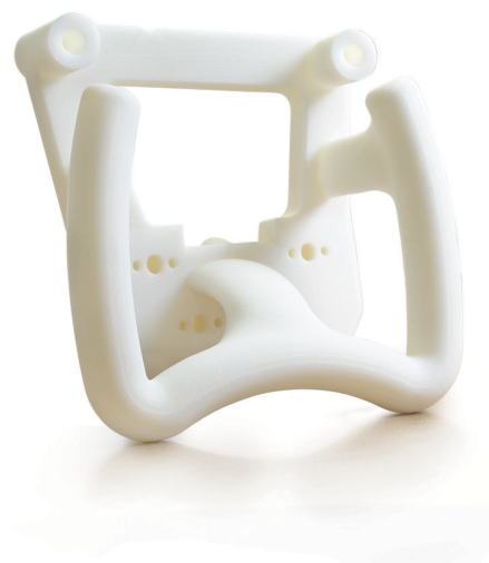
BMW's jigs and fixtures department used a Fortus® 3D Production System to manufacture assembly tools. This tool is used to affix the rear name badge.

3D printing also optimizes tool performance. Previously, designs for jigs and fixtures rarely improved past what was sufficient to do the job. Due to the expense and effort to redesign and remanufacture them, only malfunctioning tools