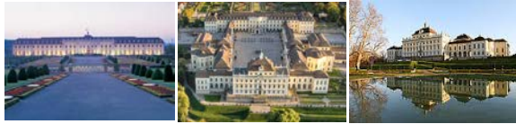
Products of the fit.com Picture Workshop