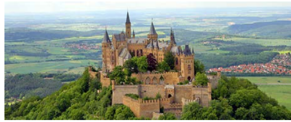
The Hohenzollern Castle, original place of Prussian kings' and German emperors' family