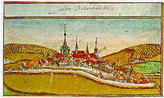
Convent Bebenhausen – Historical representation, Summer Refectory