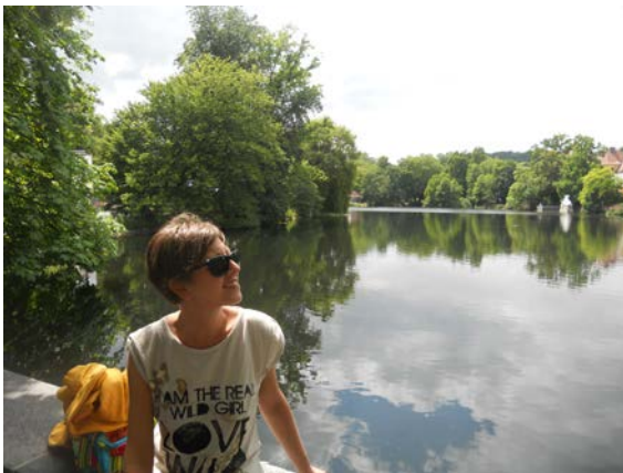
The Neckar Site, highlight of Tübingen's middle age urban architecture