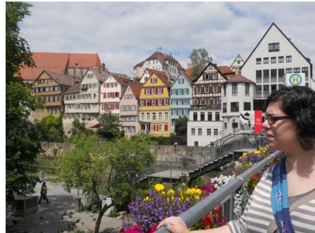
One of the places of accommodation and a view on the city