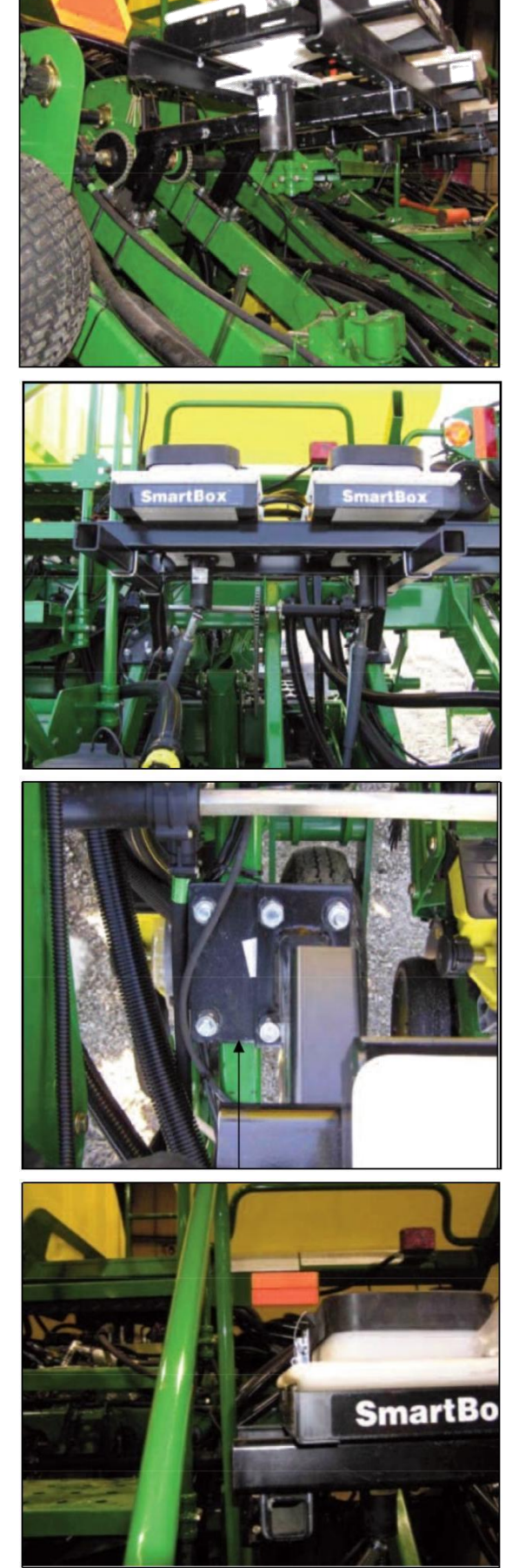
WF-2013-07 Rev.1 12/23/2013

H. For the right side ladder mounting kit, an offset plate will be used. (See diagram of SB021666 - No. 3, 8 & 11) Mount the SmartBox® base cradle and container as close to ladder as possible to achieve the most vertical drop.