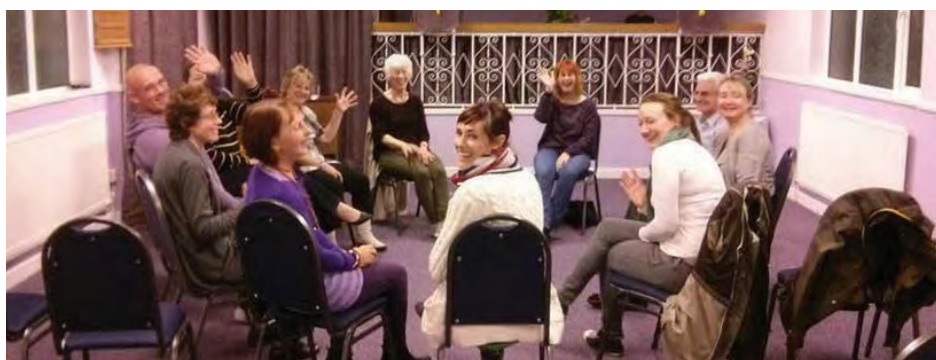
A recent development circle at Westbury Park Spiritualist Church, Bristol.