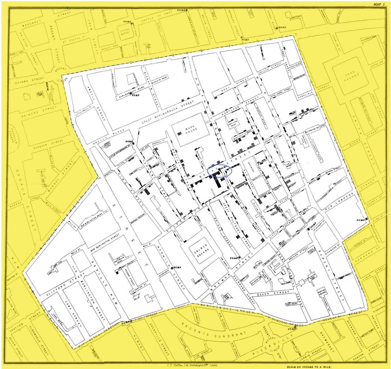
Figure 1: John Snow’s rendition of the 1850 C.F. Cheffins Company Map [Frerichs (1999)]. The white section of the map shows the area of particular interest to John Snow. The area encompassing the Broad Street Pump is circled (blue).

The location for which Dr. Snow makes reference to, within the aforementioned passage, namely, the joining of the two streets (Cambridge and Broad), is highlighted in Figure 1, via the blue circled region. Note that this passage by Snow demonstrates the severity of the outbreak. Within a ten day span of time, we find that the rate of fatal attacks of cholera was about fifty deaths per day. Moreover, Snow’s use of the phrase, “limited area,” suggests that the population in this region (Figure 1) of London is small, relative to the remaining area which comprises London. Finally, the fact that