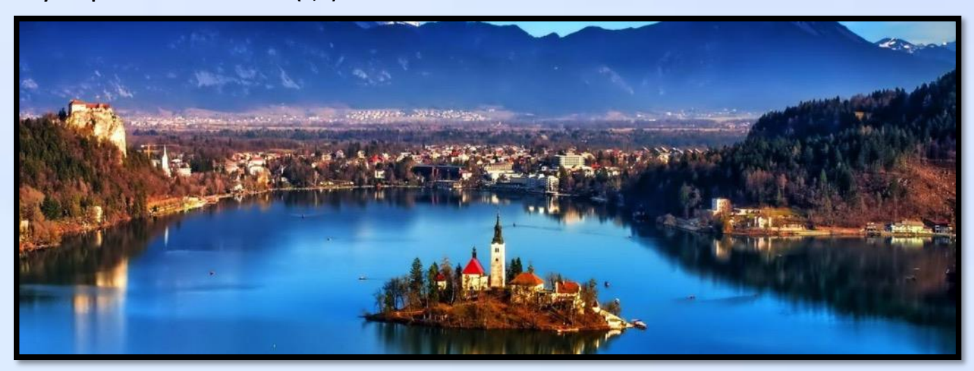
Day 5 September 21st: Lake Bled (B,D)

Welcome to Lake Bled! After our included breakfast we will set out to explore. Lake Bled is an earthly paradise. A beautiful glacial lake in the Julian Alps, set amid forests and mountains. We ascend the old castle perched on top of a steep cliff above the glacial Lake Bled. The castle terraces offer spectacular views of the lake and its tiny island in the middle. We will take a boat ride with a 'Pletna' – traditional boat made by locals and reach the only true island in Slovenia. Here we will visit Bled Castle and its museum. After our cruise we will sample the famous Bled's cream cake. This afternoon we will return to our hotel. Later we will meet for dinner.