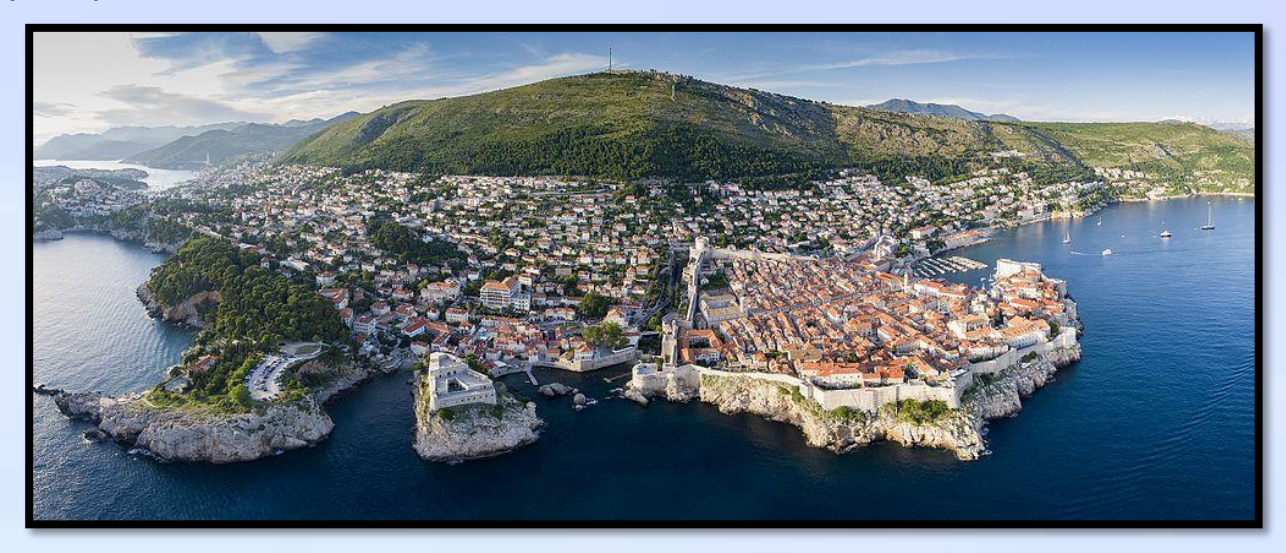
Day 14 September 30th: Dubrovnik (B,D)

After breakfast it is time for our included city tour. The gem of the Adriatic, with its stunning location on the shores of the Adriatic Sea, its carefully preserved and restored icons and its charm, medieval Dubrovnik is truly a precious gem. Sightseeing in this UNESCO World Heritage Site features a walking tour including the glorious main square, the Rector's Palace, stunning Dubrovnik Cathedral, the Dominican monastery and the Synagogue (holidays permitting); Dubrovnik's many treasures reveal traces of the Romans, Byzantines, Hungarians and Venetians who have ruled here over the centuries.