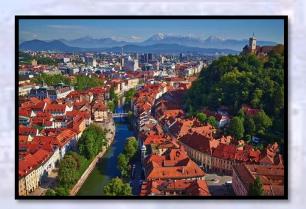
Day 6 September 22<sup>nd</sup>: Lake Bled - Ljubljana (B)

After breakfast we will board our deluxe coach and travel to the Capital of Slovenia, Ljubljana. It's is only a short drive to Ljubljana where our local guide shows us the sights including the Opera House, Cathedral, National Museum and Castle, and Three Bridges Square. After our tour we will check into our hotel where we will have free time for lunch on our own or perhaps shopping. Our evening is free to enjoy one of the many beautiful restaurants in this city of beautiful parks and green space.