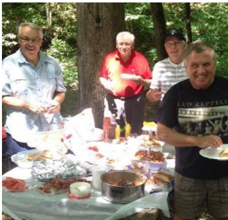
Our guys are the best! Always willing to help.