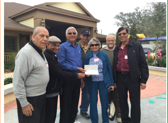
New Age Group on Jan 31, 2016 at Give Kids a World Village