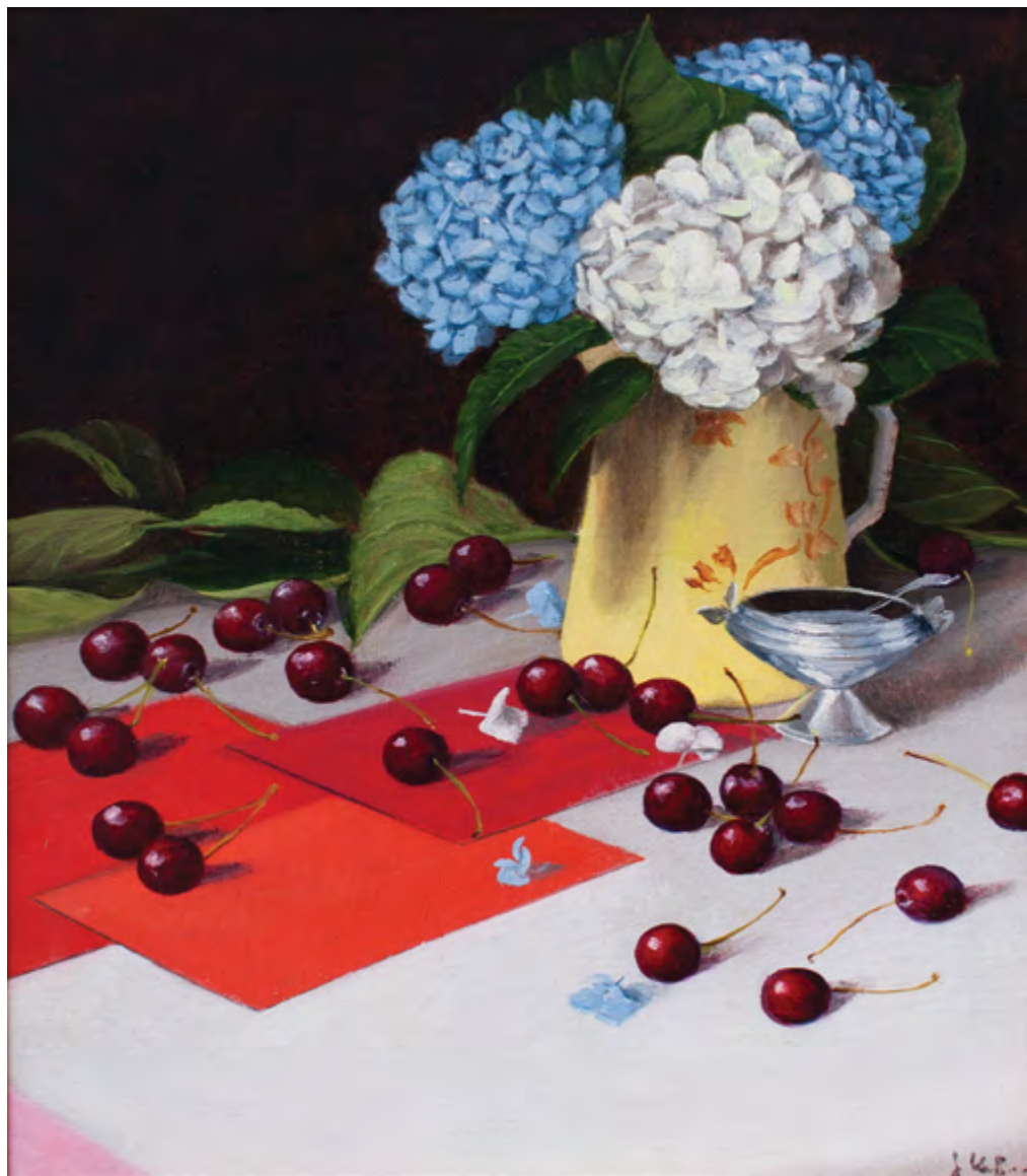
OPPOSITE In Primary Colors oil on canvas 16 x 14 inches