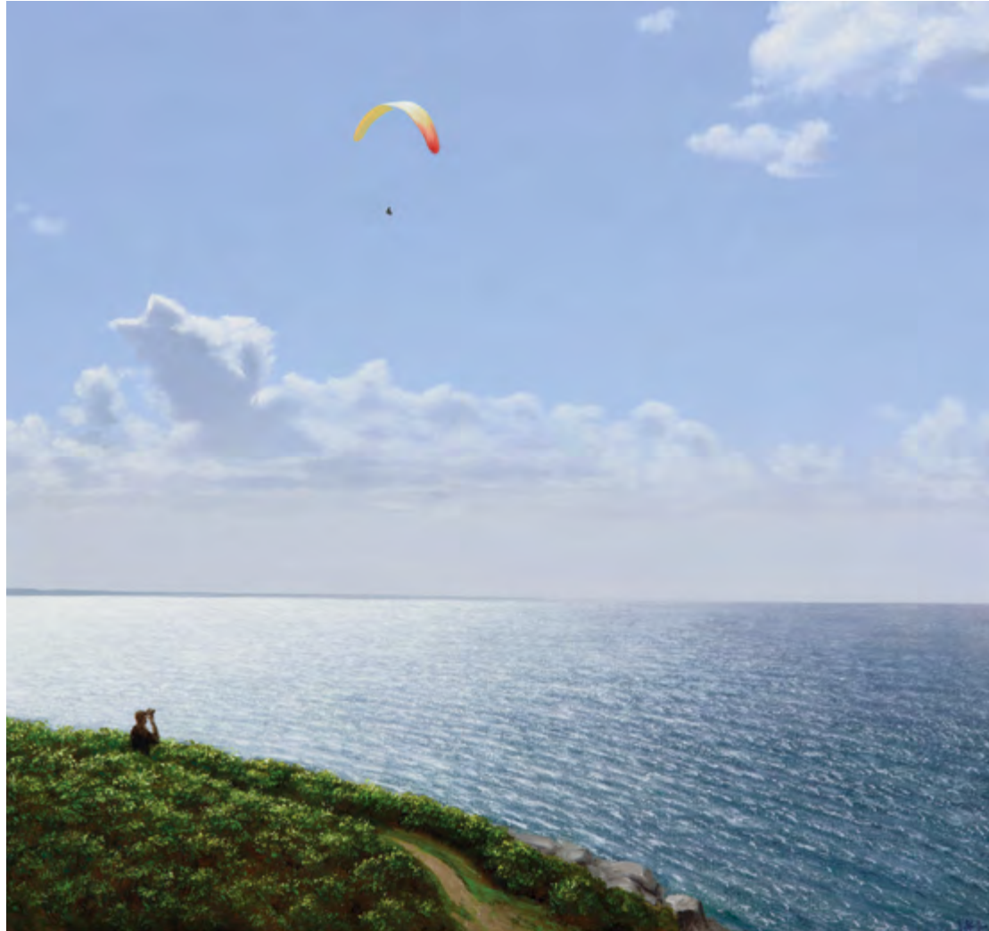
Aspiration , oil on canvas, 28 x 30 inches