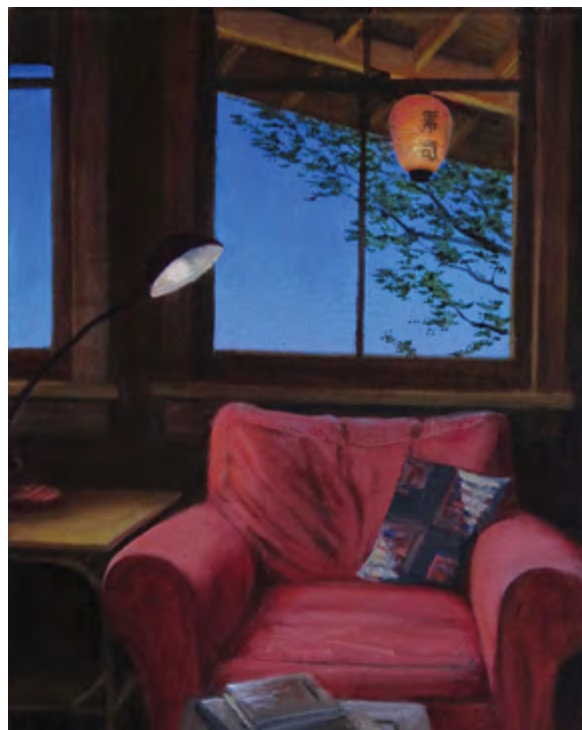
The Red Chair , oil on canvas, 15 x 12 inches

where the yellow blooms contrast with the deep blue of a bit of chinoiserie .