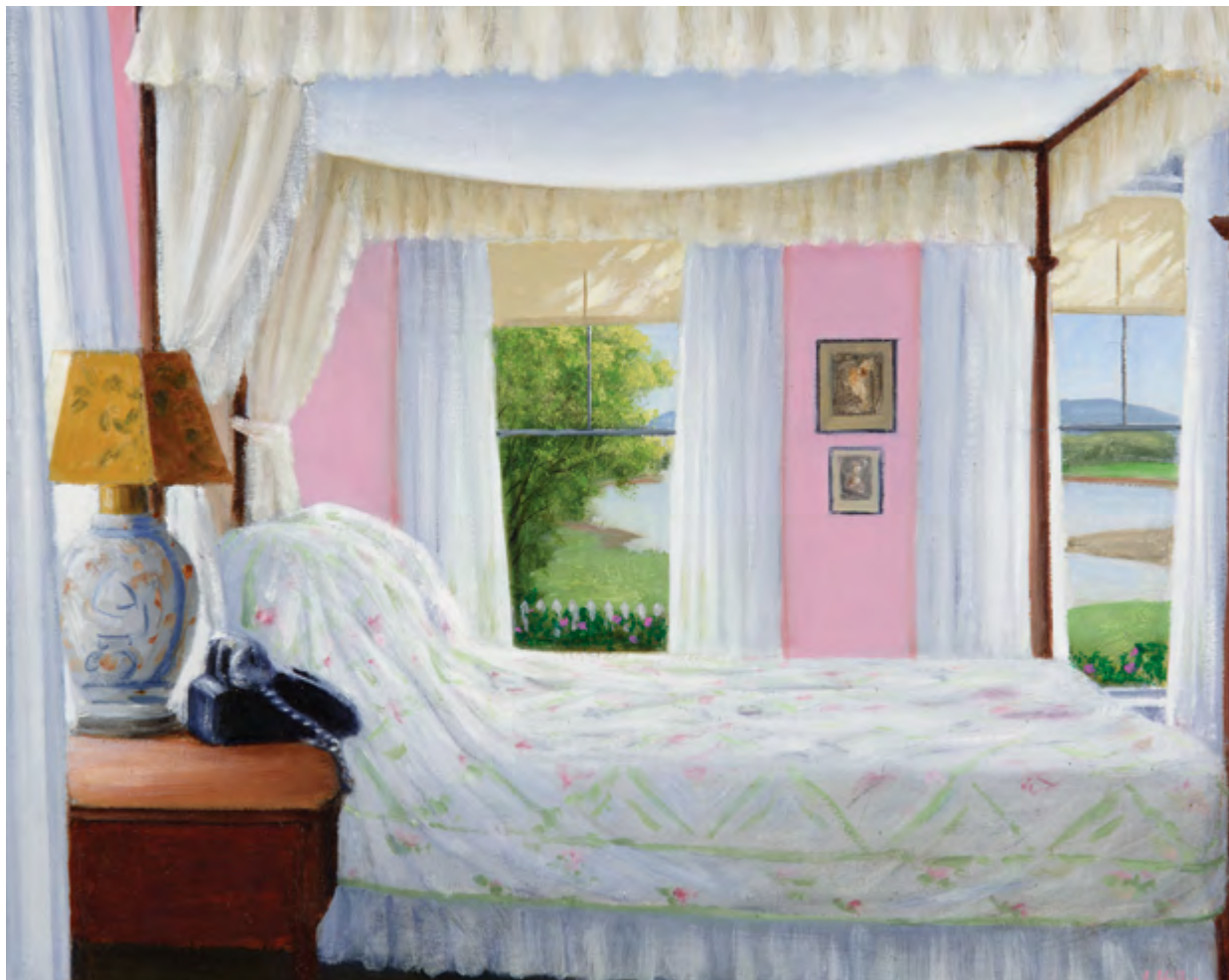
Rosie's Bed, Somesville , oil on canvas, 16 x 20 inches