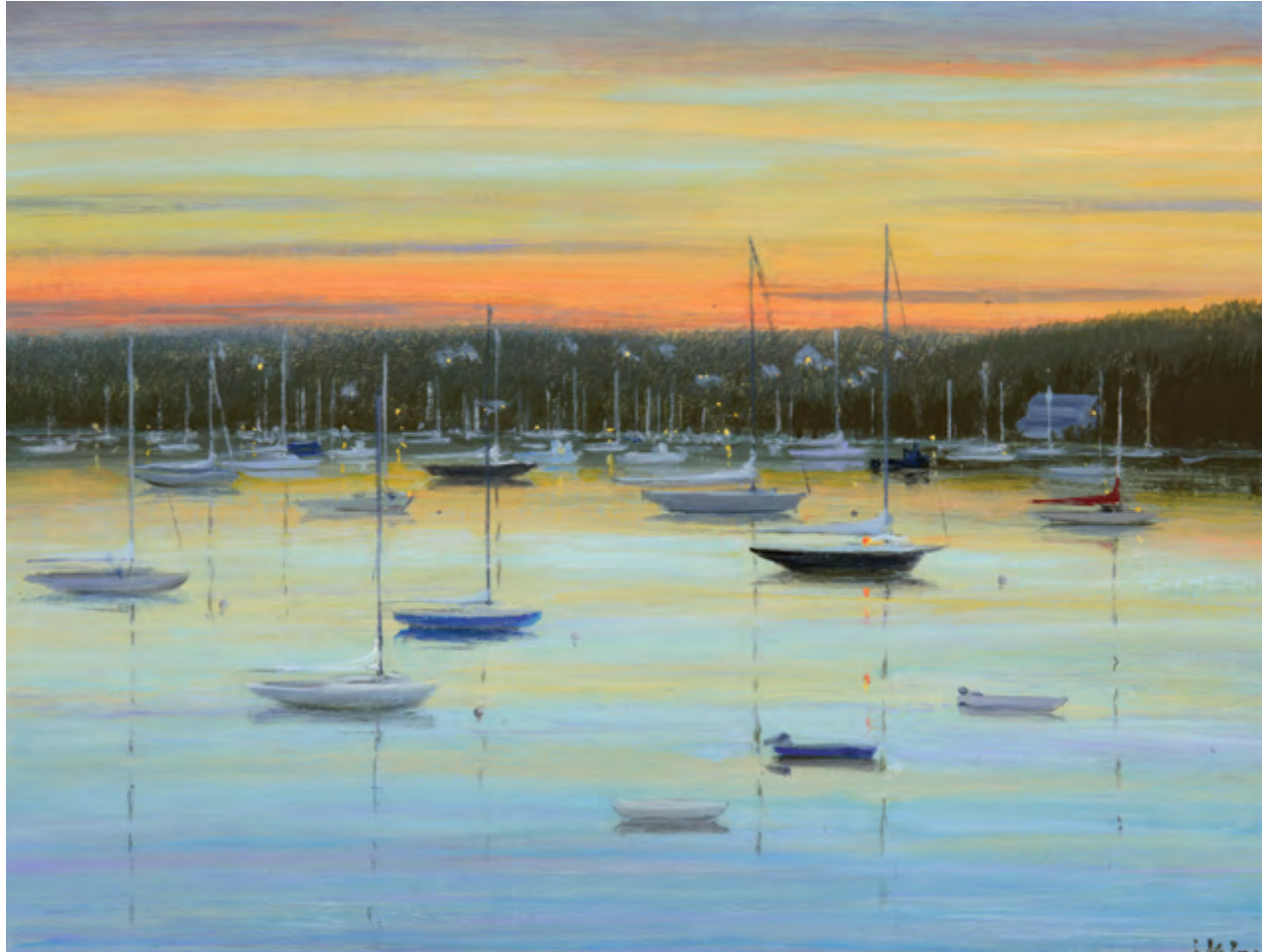
Northeast Harbor , oil on panel, 15 x 18 inches