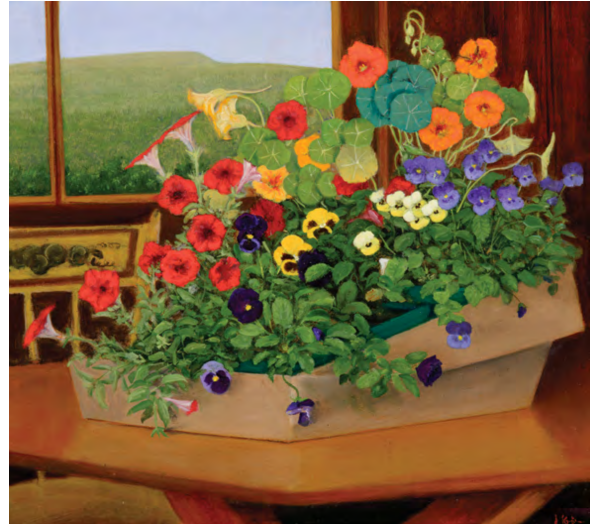
Pansies, Petunias, Nasturtiums, etc. , oil on canvas, 18 x 20 inches