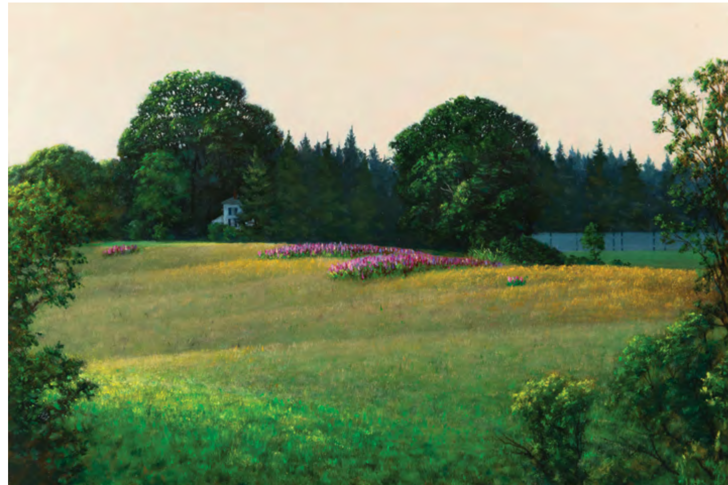
June Meadow , oil on canvas, 24 x 36 inches

For Keiffer "light carries meaning" and it is the foundation of his vision of the landscape. In the painting Somesville , he responds to the last sunlight of a summer day illuminating parts of a field that features patches of lupine. Elsewhere, Dusk over Acadia offers the twilight glow of what the French call crépuscule .