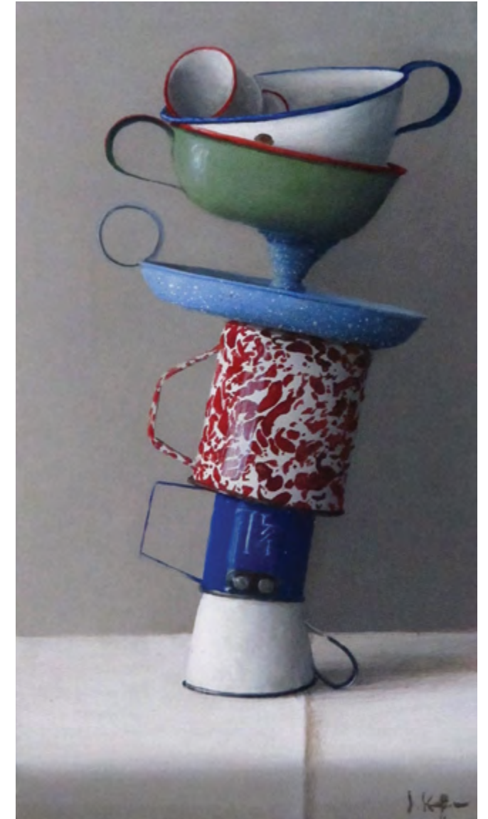
Tipsy Cups XIV oil on canvas 14 x 8 inches