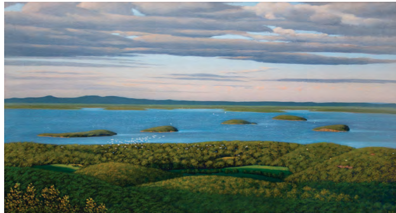
Dusk Over Frenchman Bay , oil on canvas, 20 x 36 inches

The painter is part tonalist, part luminist—and sometimes both, as in the canvas On Top of the World with its nightfall atmosphere and glory rays. In a sunset view of Northeast Harbor as seen from Thuya Garden, bands of orange create an evanescent scene.