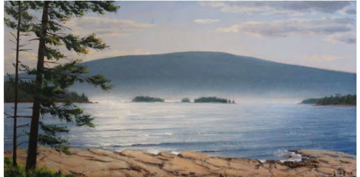
Glaring Sun, Maine , oil on panel, 10 x 20 inches