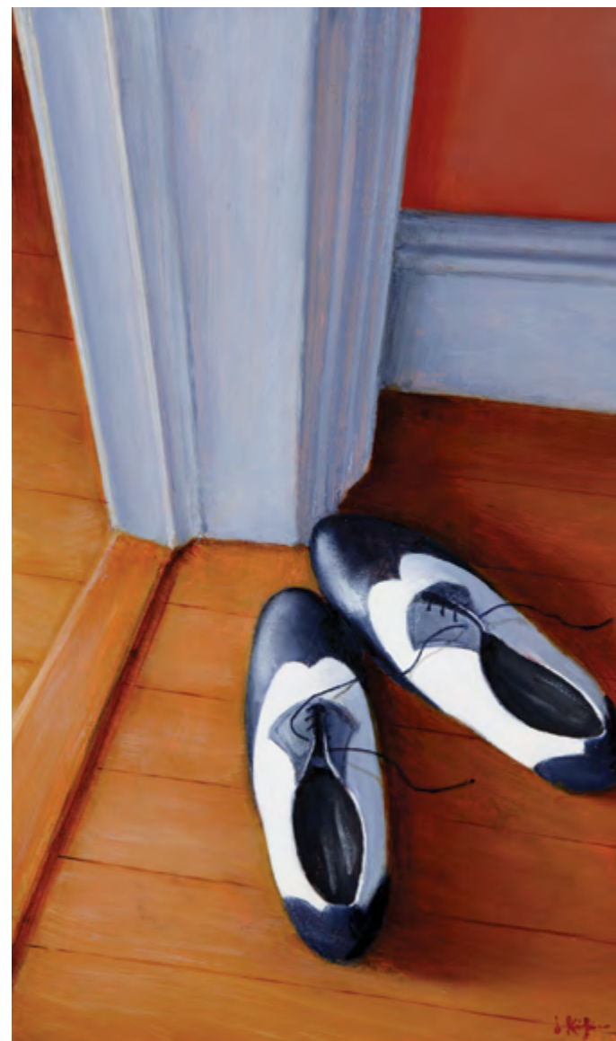
Delilah's Shoes oil on canvas 20 x 12 inches