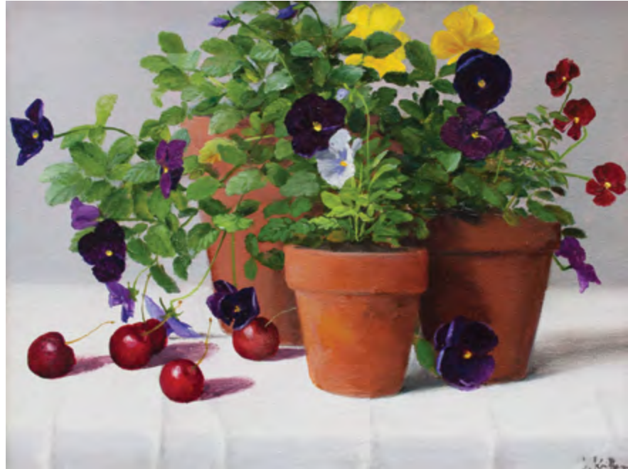
New Potted Pansies oil on canvas 9 x 13 inches