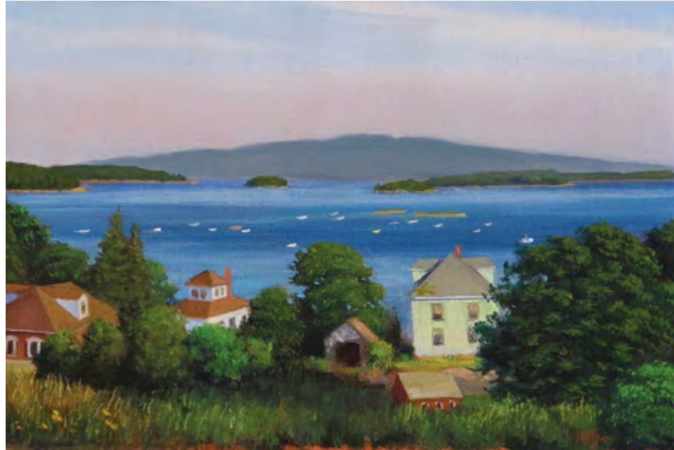
Stonington , oil on canvas, 10 x 15 inches