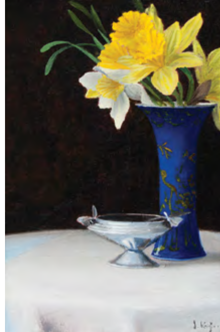
Daffodils in Chinese Vase oil on canvas 12 x 8 Inches