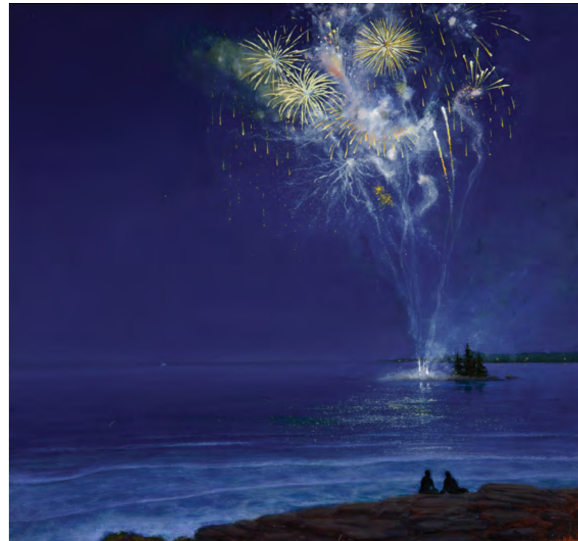
Apocalypse! , oil on canvas, 30 x 30 inches