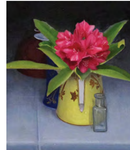
Rhododendrom Blossom , oil on panel, 12 x 10 inches