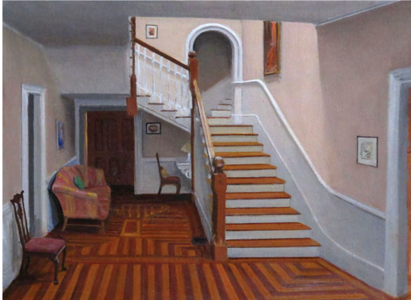
Pink Foyer , oil on canvas, 14 x 18 inches