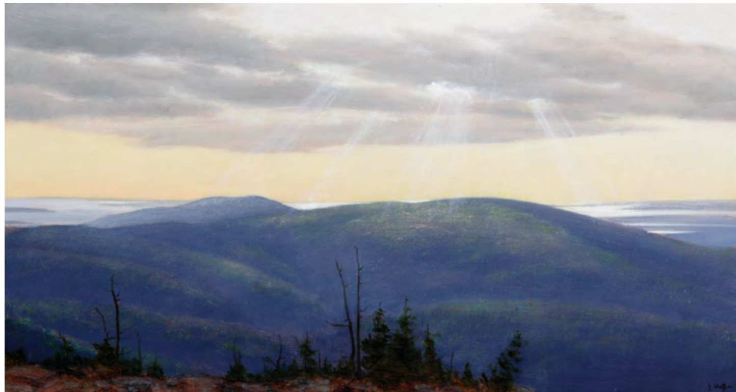
On Top of the World , oil on canvas, 16 x 30 inches