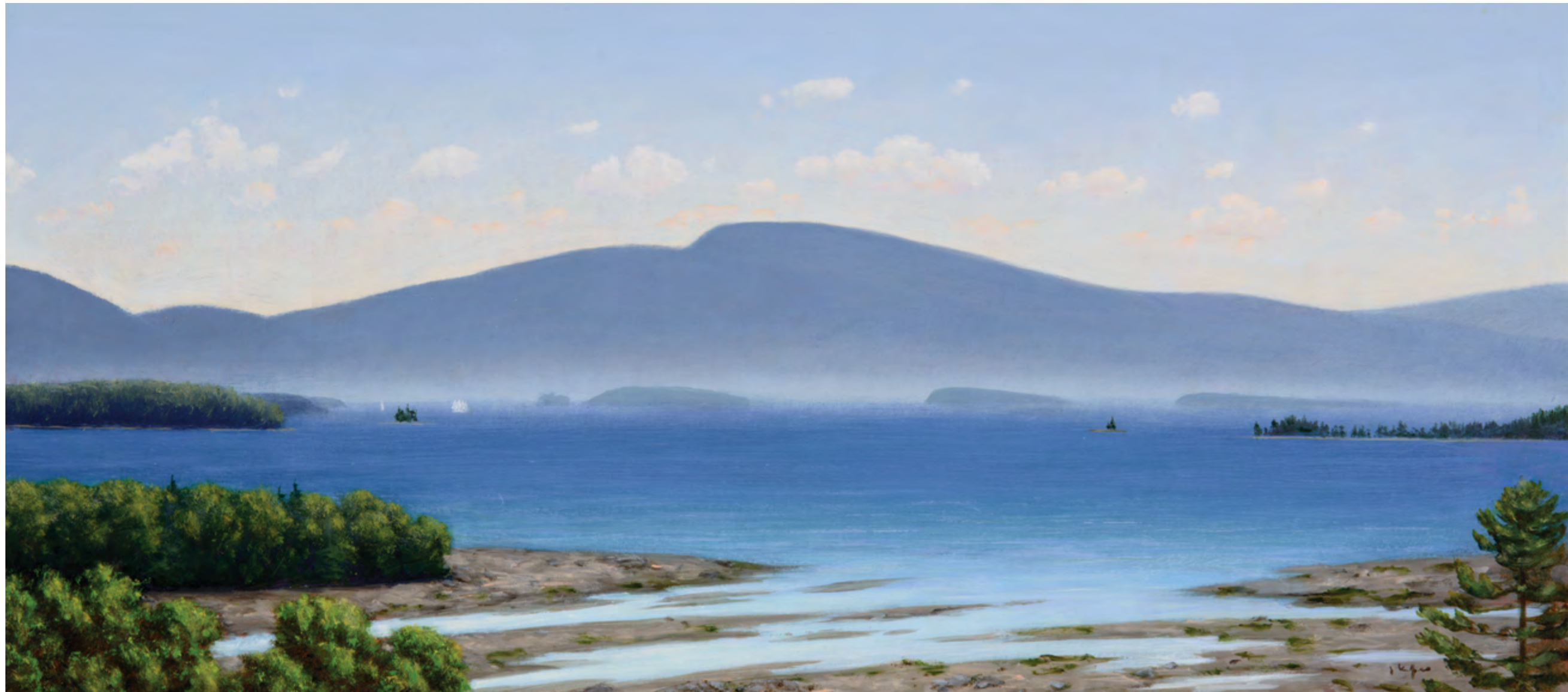
Frenchman Bay oil on canvas 18 x 40 inches