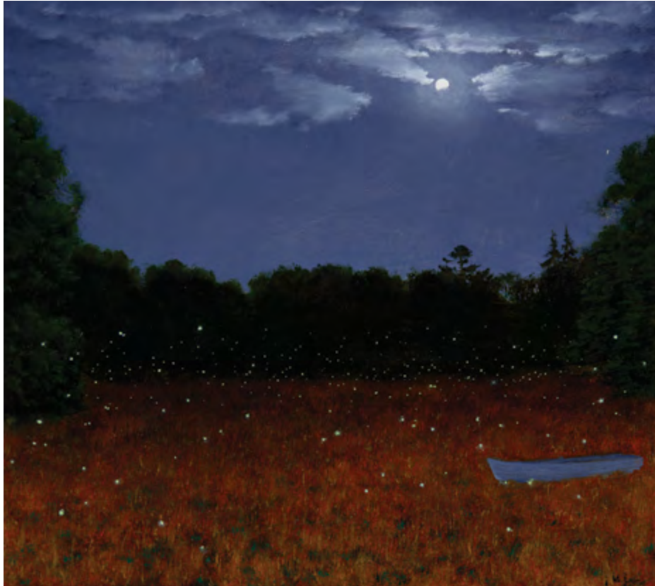
Fireflies II , oil on canvas, 18 x 20 inches