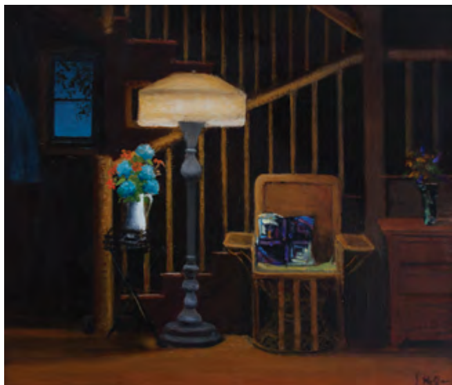
Lamplight , oil on panel, 12 x 14 inches

Twenty or so years ago, when my family lived on Oak Hill Road in Somesville, one summer night the field behind our house filled with fireflies. It was a dazzling display, the intermittent flashes spread over the near distance. We looked on in wonder.