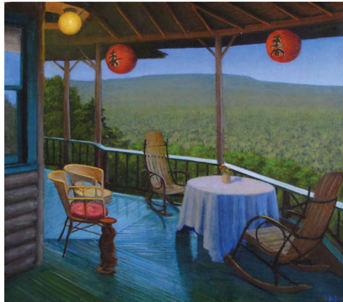
Porch at Twilight , oil on canvas, 18 x 20 inches