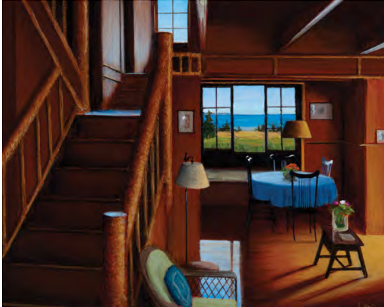
OPPOSITE A Cozy Cottage oil on canvas 13 x 16 inches