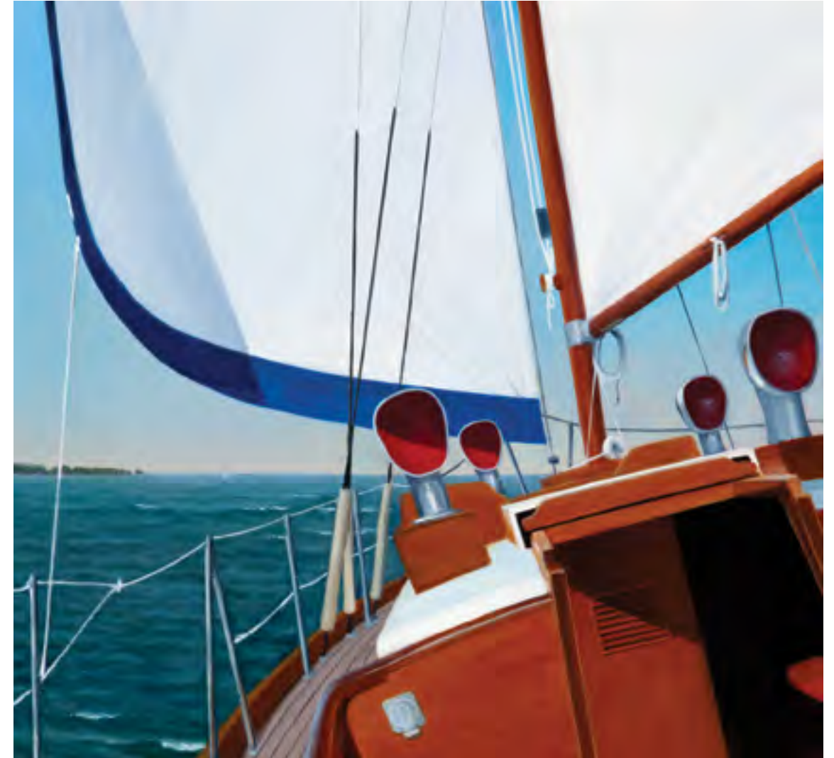
Wing and Wing , oil on canvas, 28 x 30 inches

NEXT PAGE September , oil on canvas, 20 x 50 inches