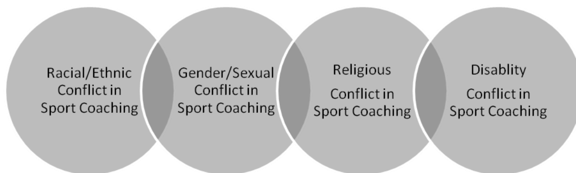
Figure 1: Dimensions of potential sociocultural conflict between coaches and athletes

The most commonly reported and observed conflicts generally involve the following actions by coaches: