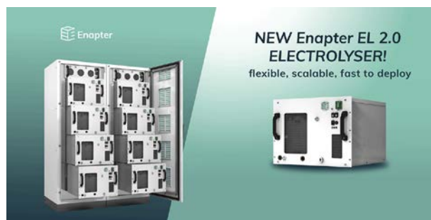
Enapter Anion Exchange Membrane Electrolyzer

With a kilogram of hydrogen (the energy equivalent of 1 gallon of gasoline) selling for $16 on the street, not many of us are rushing to buy a fuel cell anything. Enapter (Pisa, Italy), formerly ACTA, manufactures a compact $10,000 anion exchange membrane (AEM) electrolyzer. Recent improvements to their assembly line cut costs by 20%, but the big advantage of AEM technology is that none of the expensive platinum group metals are needed. As opposed to PEM electrolyzers where positive hydrogen ions (protons) pass through the membrane, in AEM the negative OH ions pass through.