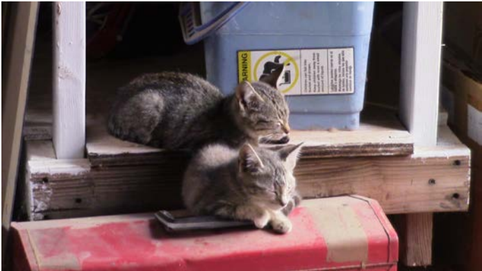
Stray kittens napping after drinking all our half & half