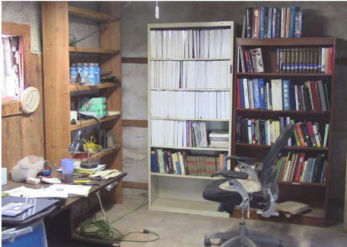
Starting to organize 2,000 book library