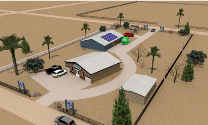
Future AHA Maricopa HQ (Zimmer Design)