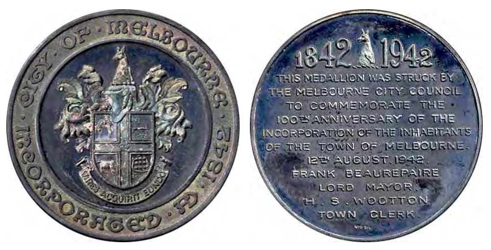
Figure 7. The City of Melbourne Centenary Medallion (Carlisle 1942/1), Angus & Coote 1942<sup>36</sup>

On 31 July, Mr. Wootton sent a letter to Angus & Coote requesting 130 silver plated copper medallions with jewel cases at 6/3d each.<sup>37</sup> It is also worth noting that this letter firmly stated "It is distinctly understood that this acceptance of your offer is subject to the condition that the name of your firm shall not appear on the medallions." Mr. Wootton also went on to request that "every effort to be made to effect delivery by 18<sup>th</sup> August" so that the medallions could be sent to the recipients with their copies of the minutes of the special council meeting. A subsequent telegram from Angus & Coote went on to explain that sixty pounds of standard wire gauge soft cold rolled copper would be required for the production of 130 medallions.<sup>38</sup>