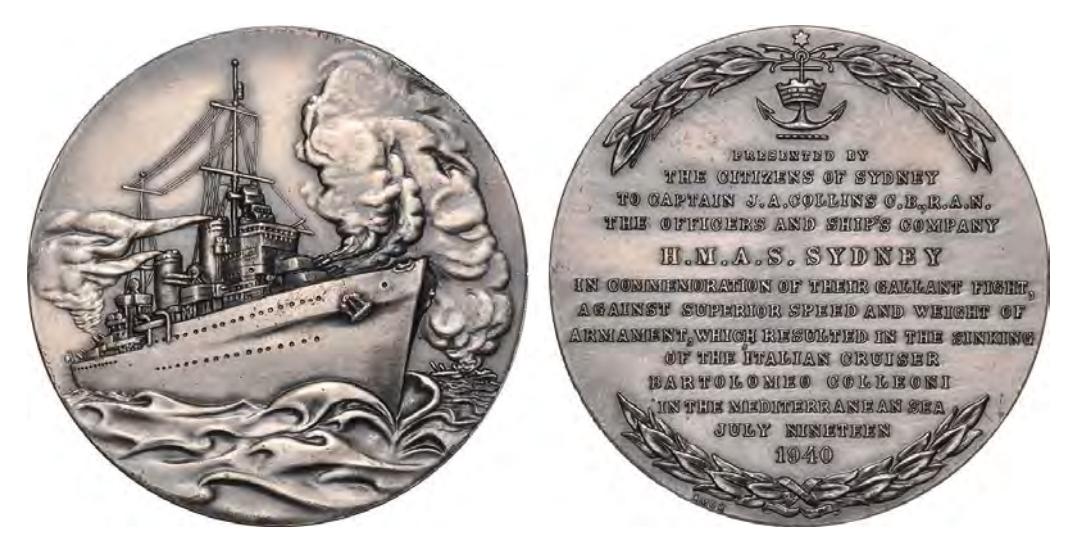
Figure 1. HMAS Sydney; Sinking of the Bartolomeo Colleoni. Amor, Sydney 19409