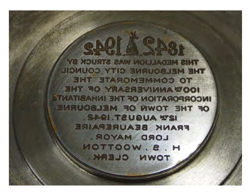
Figure 8. Reverse Die of Ciy of Melbourne Centenary Medallion - Melbourne City Council Collection

returned<sup>56</sup>. On 7 December, the dies were shipped from Angus & Coote in Sydney back to Melbourne, one of which, the reverse, still resides in the city's Collection today.