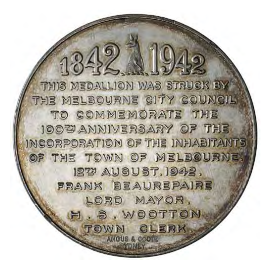
Figure 9. Reverse City of Melbourne Centenary Medallion ex. Leslie J Carlisle<sup>68</sup>.