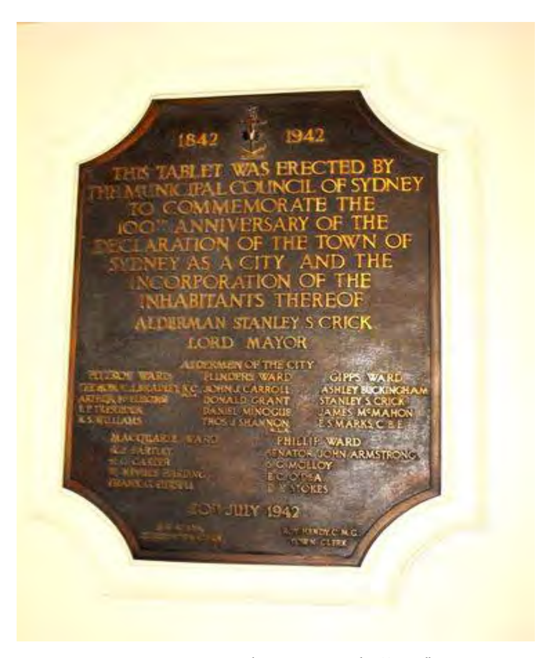
Figure 2. Commemorative plaque at entrance to Sydney Town Hall

It would have been around this time that any trial pieces, such as the bronze specimen offered by Noble Numismatics in November 1994, <sup>22</sup> would have been struck.