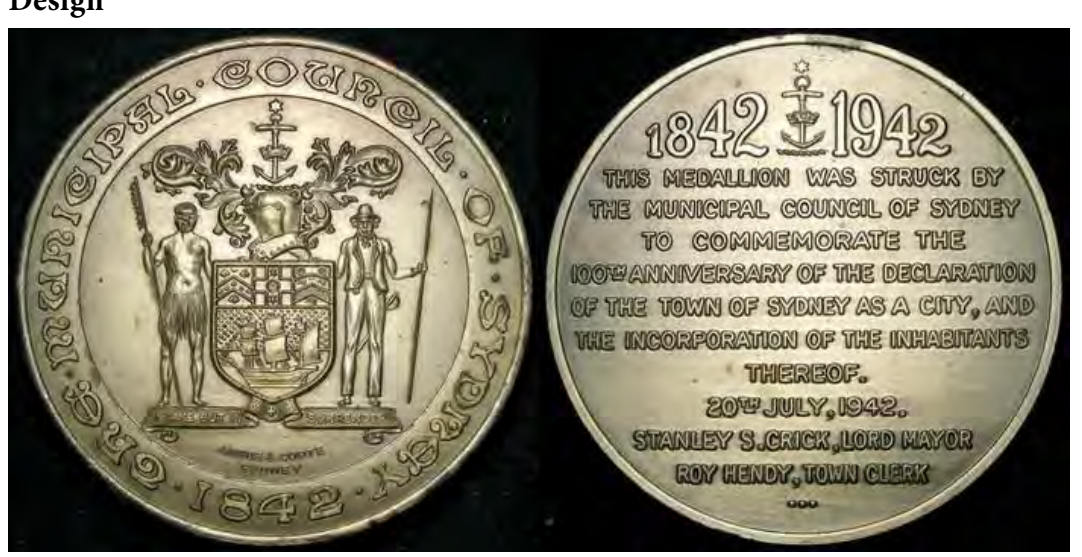
Figure 4. The Municipal Council of Sydney Centenary Medallion (Carlisle 1942/2), Angus & Coote 1942<sup>25</sup>

The reverse design of the medallion is predominantly text surmounted with the dates 1842 and 1942 separated by the crest of the City's coat of arms, an anchor encircled by a crown with a star above and a wavy line, representative of the ocean, below. The obverse design of the medallion features the city's full coat of arms surrounded by the legend proclaiming "The Municipal Council of Sydney, 1842". The arms, based on an 1857 design by a draughtsman in the City Surveyor's Department, Monsieur de St Remy, were officially granted to the city on 30 July 1908. The upper part of the shield shows the arms of Sir Thomas Hughes, Captain James Cook, and Thomas Townshend, 1st Viscount Sydney. The presence of Cook's and Townshend's arms are self-explanatory, however Sir Thomas Hughes is perhaps less well known.