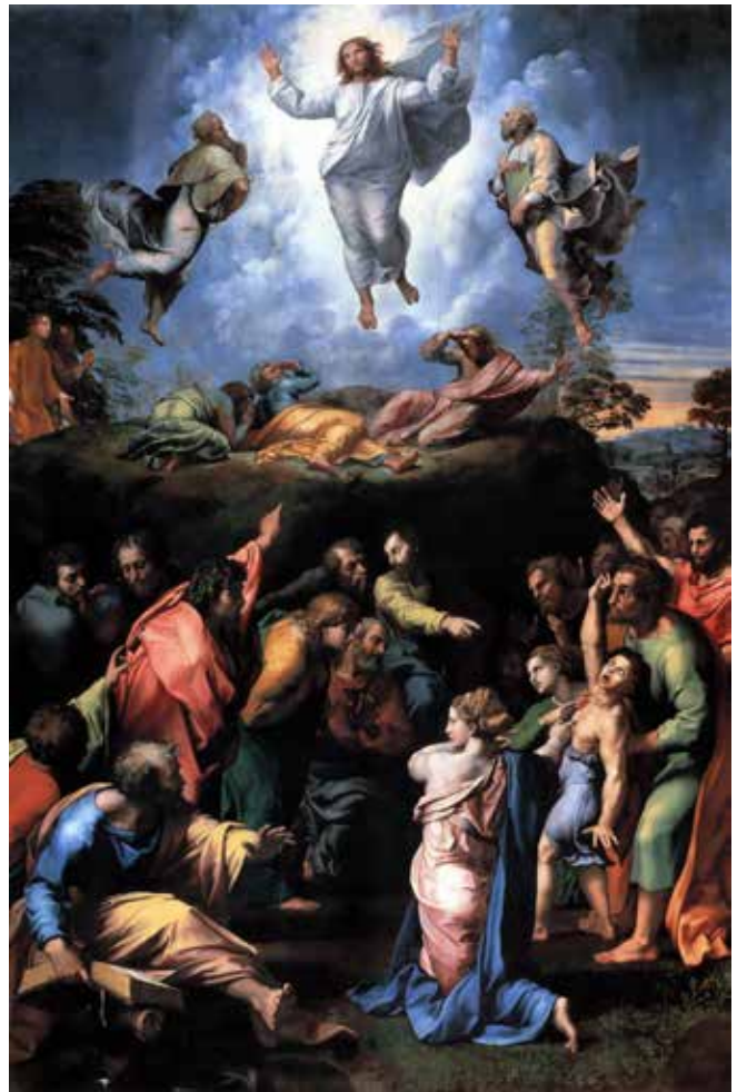
Transfiguration, by Rafael

Jesus took Peter, John, and James and went up the mountain to pray. While he was praying his face changed in appearance and his clothing became dazzling white. And behold, two men were conversing with him, Moses and Elijah, who appeared in glory and spoke of his exodus that he was going to accomplish in Jerusalem. Peter and his companions had been overcome by sleep, but becoming fully awake, they saw his glory and the two men standing with him. As they were about to part from him, Peter said