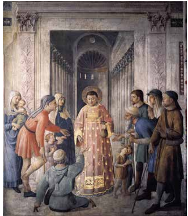
St. Lawrence Distributing Alms, by Bl. Fra Angelico.

There are a number of ways that the Church offers us to enter more deeply into Lent. In