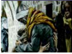
Parable of the Prodigal Son , by James Tissot

Directions: Reflect on the painting Parable of the Prodigal Son by James Tissot using the discussion questions.