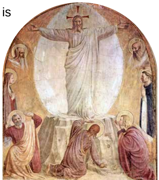
Transfiguration, by Bl. Fra Angelico

The good news is that Jesus died on the Cross to save us from sin. He invites us to love Him and accept His gift of salvation.