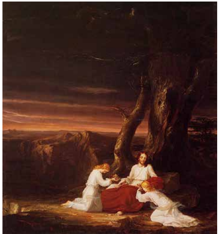
Angels Ministering to Christ in the Wilderness, by Thomas Cole

Filled with the Holy Spirit, Jesus returned from the Jordan and was led by the Spirit into the desert for forty days, to be tempted by the devil. He ate nothing during those days, and when they were over he was hungry. The devil said to him, “If you are the Son of God, command this stone to become bread.” Jesus answered him, “It is written, One does not live on bread alone. ” Then he took him up and showed him all the kingdoms of the world in a single instant. The devil said to him, “I shall give