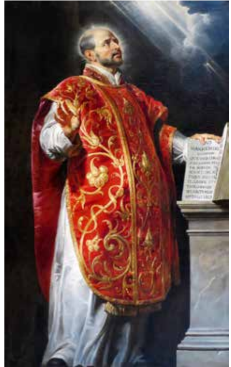
St. Ignatius of Loyola, by Peter Paul Rubens

Every day during Lent (or as often as your class chooses to do it) use the following examen questions to reflect and to pray.