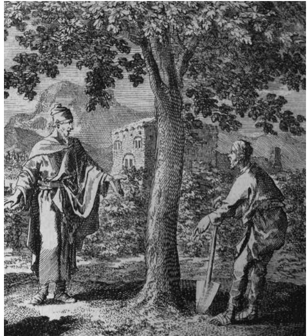
Parable of the Fig Tree woodcut.

We are just like the fig tree. When we sin, we aren't producing fruit – we aren't doing good things. But, Jesus came to give us another