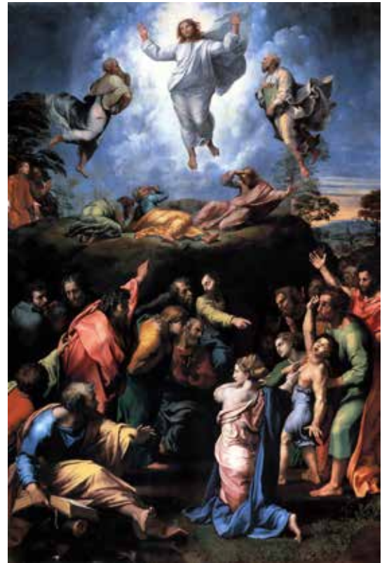
Transfiguration, by Rafael

Jesus took Peter, John, and James and went up the mountain to pray. While he was praying his face changed in appearance and his clothing became dazzling white. And behold, two men were conversing with him, Moses and Elijah, who appeared in glory and spoke of his exodus that he was going to accomplish in Jerusalem. Peter and his companions had been overcome by sleep, but becoming fully awake, they saw his glory and the two men standing with him. As they were about to part from him, Peter said to Jesus, “Master, it is good that we are here; let us make three tents, one for you, one for Moses, and one for Elijah.” But he did not know what he was saying. While he was still speaking, a cloud came and cast a shadow over them, and they became frightened when they entered the cloud. Then from the cloud came a voice that said, “This is my chosen Son; listen to him.” After the voice had spoken, Jesus was found alone. They fell silent and did not at that time tell anyone what they had seen.