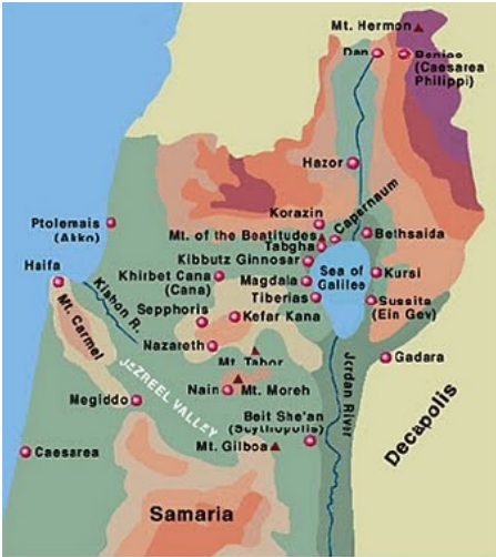
The Valley of Jezreel, also known as the Valley of Armageddon

Let us look at the big picture so we do not get fooled. For the true battle in Revelations, we believe that we can not only look at (Revelation 16:16) that talks about Armageddon but in context, we must also look at (Revelations 12 to 22) where it talks about the Woman clothed with the Sun, with the moon under her feet and on her head a crown of twelve stars