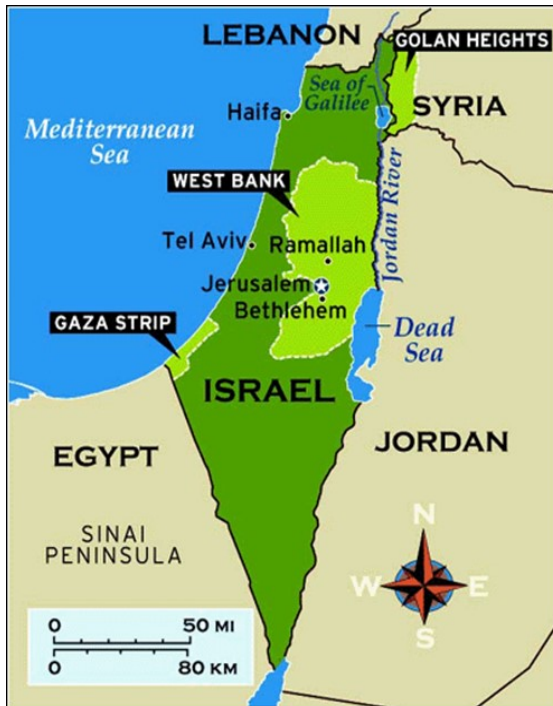
A General map of Israel with its neighbors.

Meghan: That is a little but powerful place.