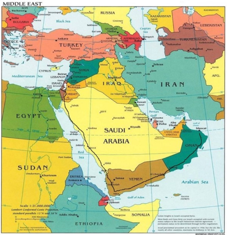
A General map of Israel with its neighbors.

Overview map which shows that Israel is part of the Middle East with Iraq, Iran, Saudi Arabia, and Turkey located close by.