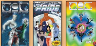
Out In Comics guides, 2000, 2001, 2002