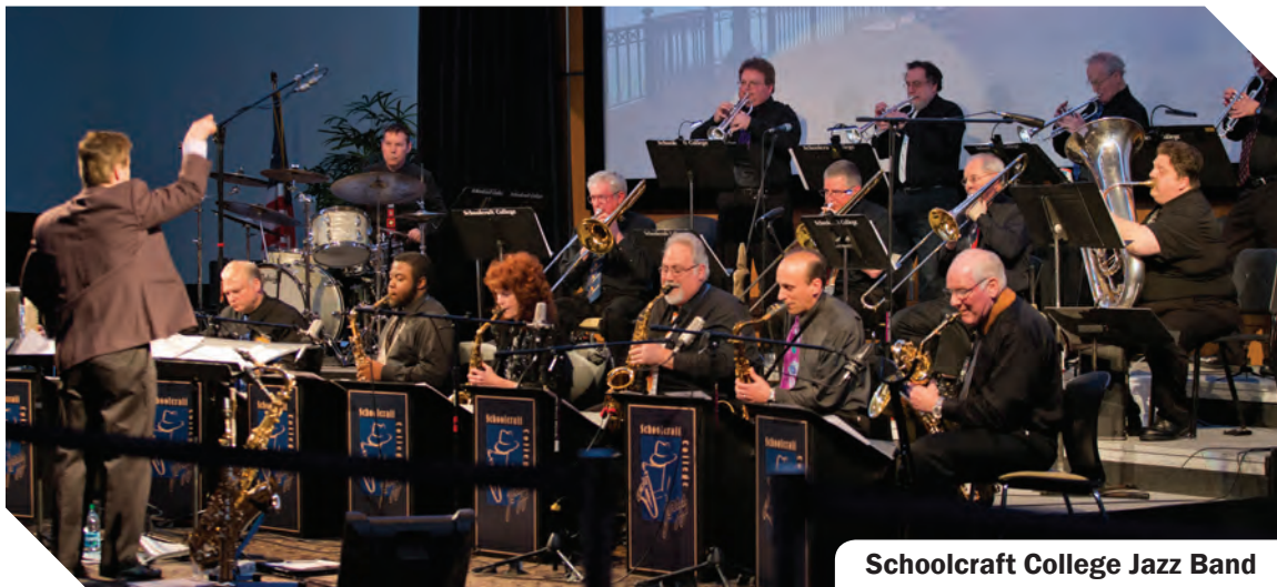
Schoolcraft College Jazz Band