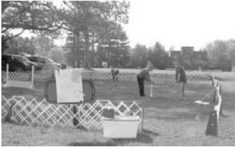
Setting up the performance ring at the show