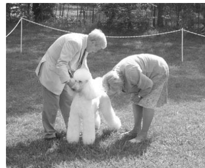
Sweeps winner Ch. Ale Kai Mikimoto on Fifth