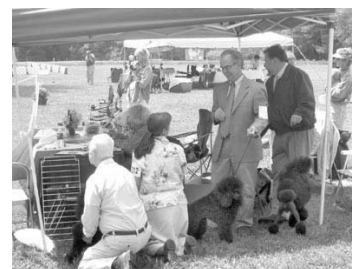
Getting ready to enter the ring