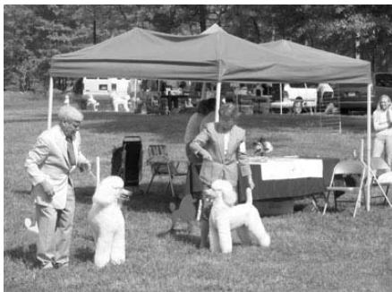
Standard Veterans Sweeps