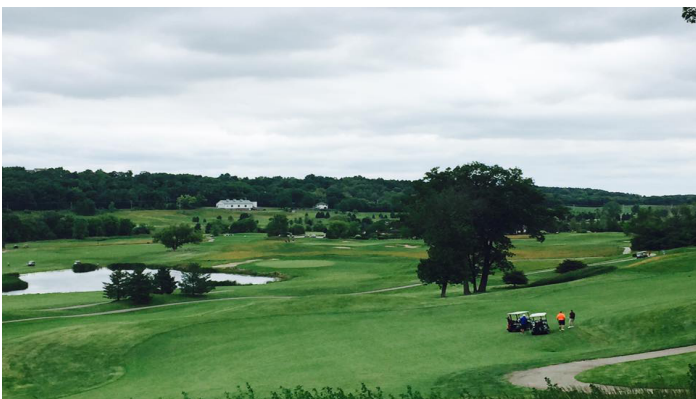
A beautiful view at Hawk's View Golf Club