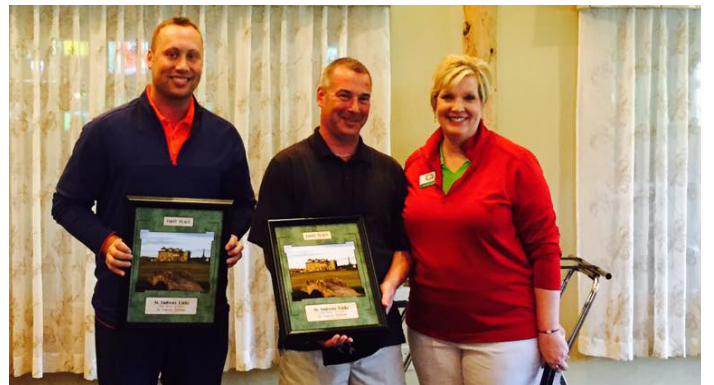
The winning team at this year's outing