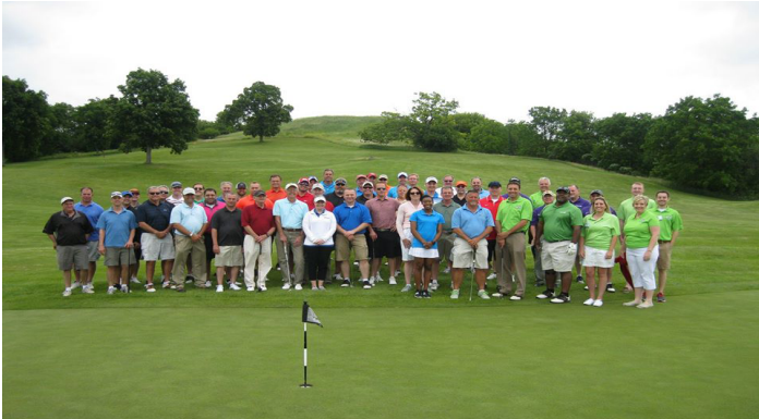
The entire group that attended this year's outing!