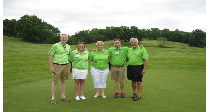
The Wisconsin Clean Cities team