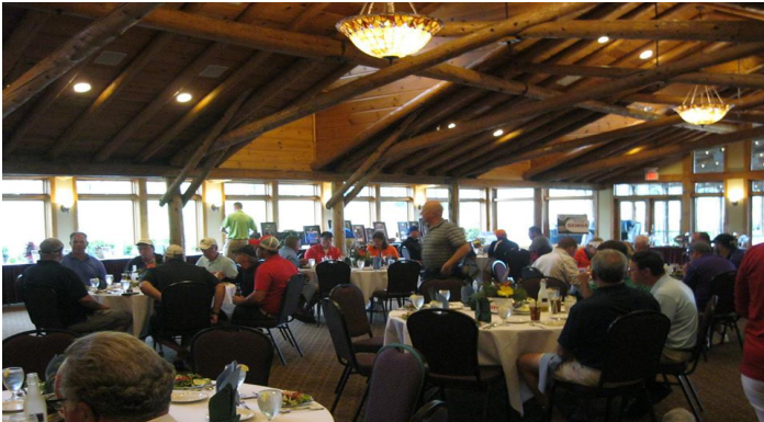
Dinnertime in the ballroom at Hawk's View Golf Club