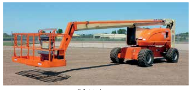
JLG 800A 4x4