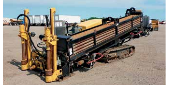
2011 Vermeer D36X50