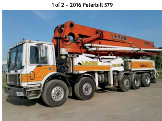
2015 Peterbilt 389 2013 Peterbilt 386 Mack MR688S w/Schwing 42 Meter