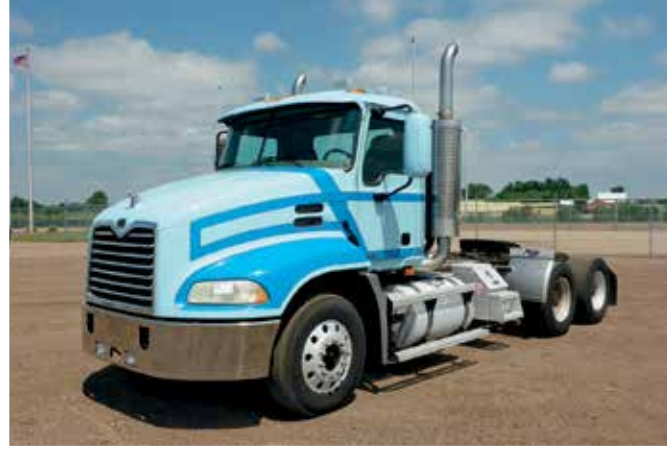
2011 Kenworth T800 2013 Kenworth T600 Mack CX613