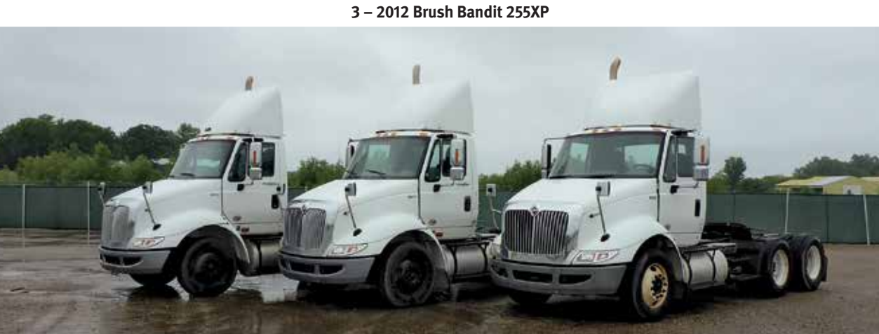
3 - 2012 International 8600