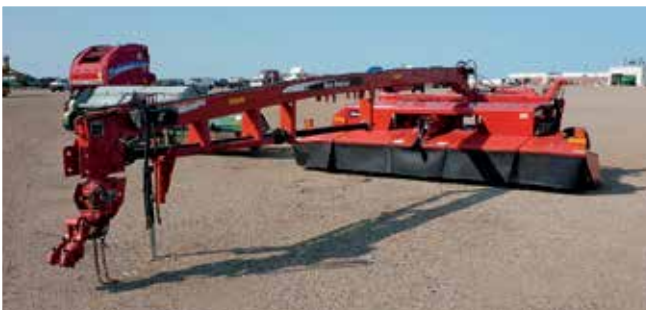
New Holland 1441