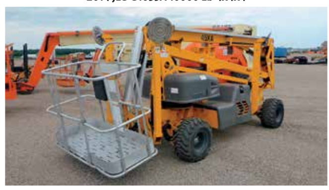
2015 Haulotte 45XA 4x4