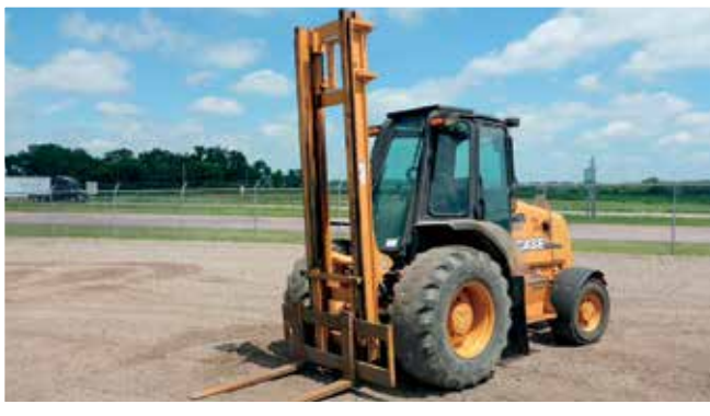
Case 586G 4x4