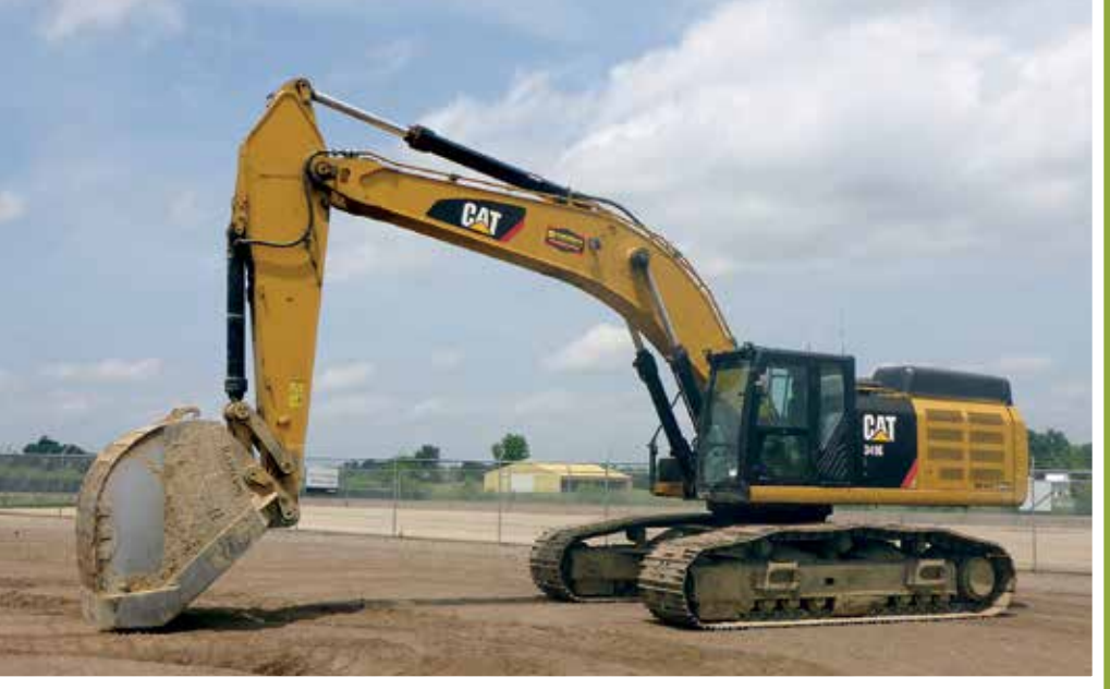
2013 Caterpillar 349EL w/Variable Gauge Undercarriage