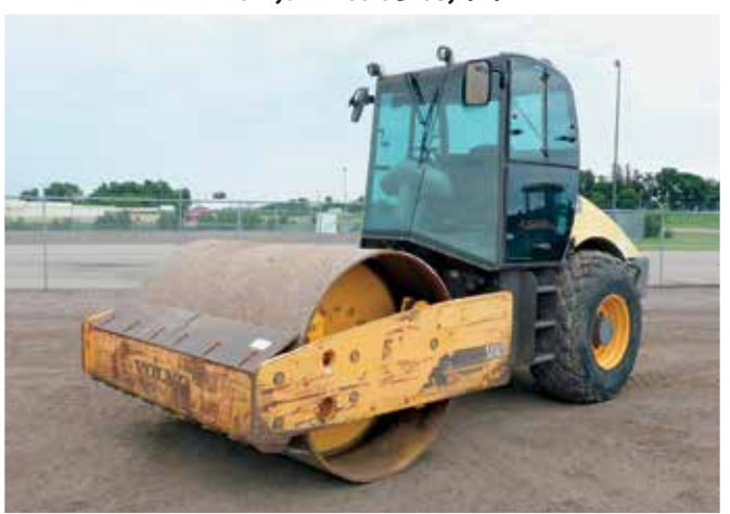
Galion 150A 2012 Volvo SD116DX 2011 Volvo SD100D