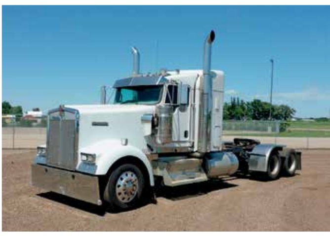
2015 Kenworth W900