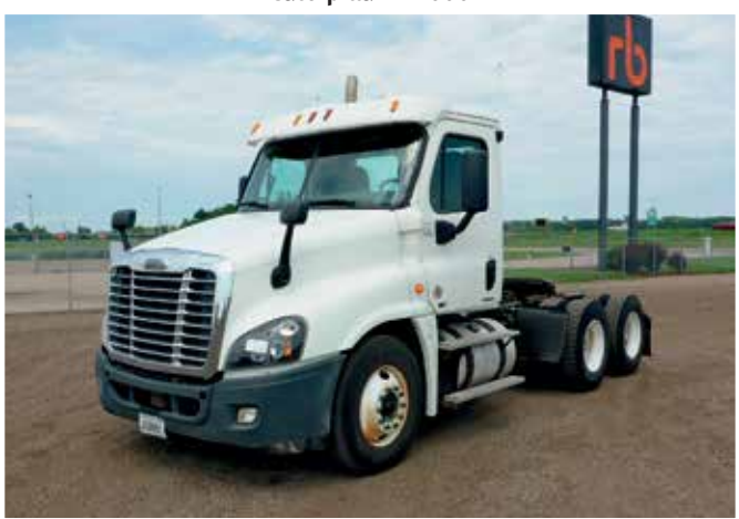
1 of 2 – 2012 Freightliner X12564ST