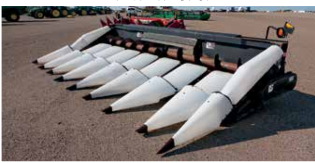
Harvestec 4308C 30 In. 8 Row