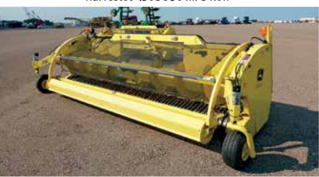
2013 John Deere 645C 15 Ft