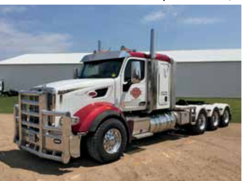
2015 Peterbilt 567 Tri Drive