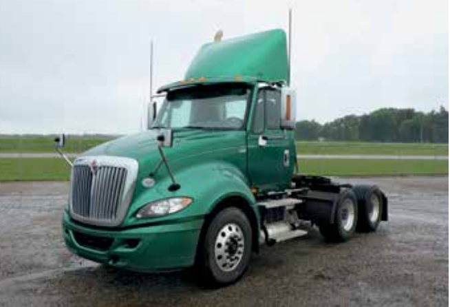
2012 International ProStar