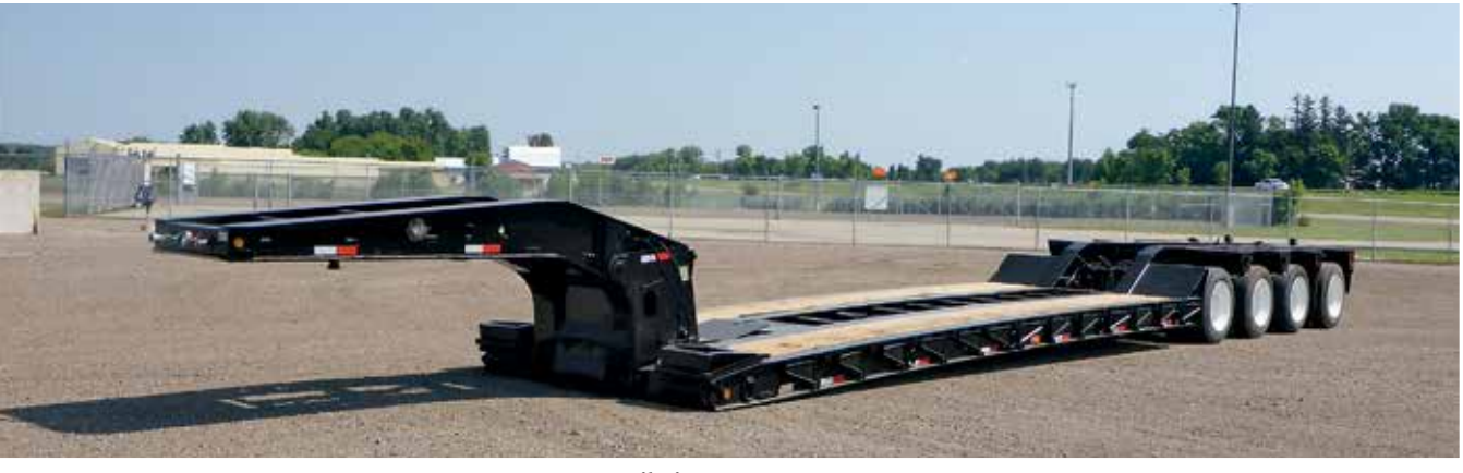
Trail King TK110HDG513

Equipment videos, photos, auction news and more. Like us on facebook.com/RitchieBros