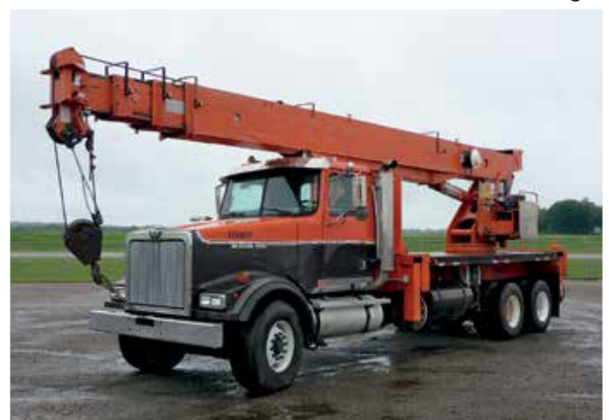
Western Star 4964TX w/Terex RO RS60100