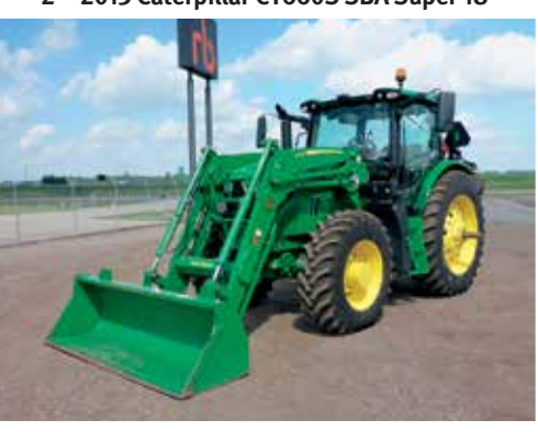
2017 John Deere 6155R