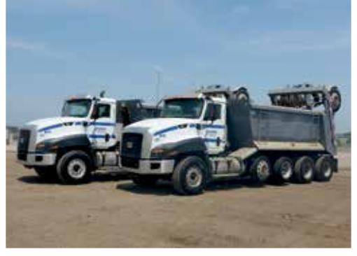
2 - 2013 Caterpillar CT660S SBA Super 18