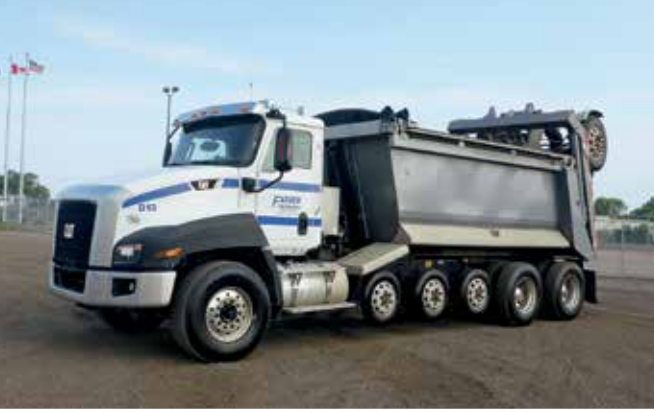
See complete auction and equipment information on our website rbauction.com