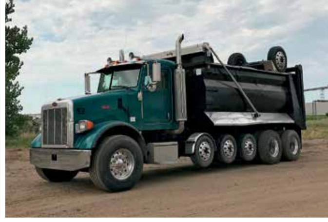
Chevrolet C8500 Mack CV713 Peterbilt 357 Super 18