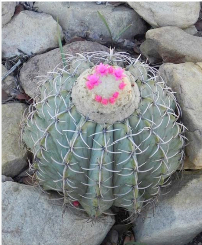
Melocactus glaucescens , photo in Bahia, Brazil by Marcio Roberto Oliveira (2013)

Since the red, wool-coated cephalium of the plant is similar to the Fez hat of the Turkish male citizens during late Ottoman Empire, one name for the plant is Turk's cap cactus.