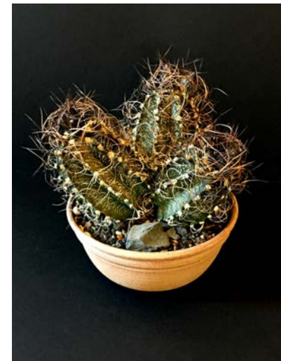
Astrophytum capricorne spp. niveum Elton Roberts