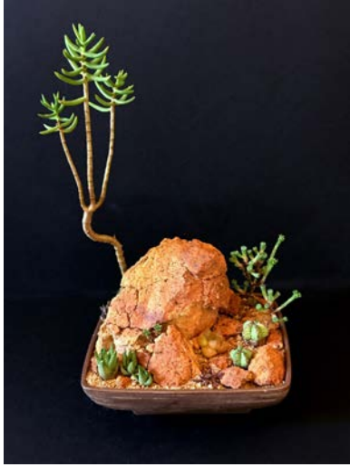
'In the Namib' Peter Beiersdorfer

Fred photographed these plants against a black background to provide a uniform setting and eliminate any background distractions. This page displays a random few of these exceptional plants, following the selections in the June issue of On the Dry Side . The full set of photographs will be available soon on the Society's Facebook page and website.