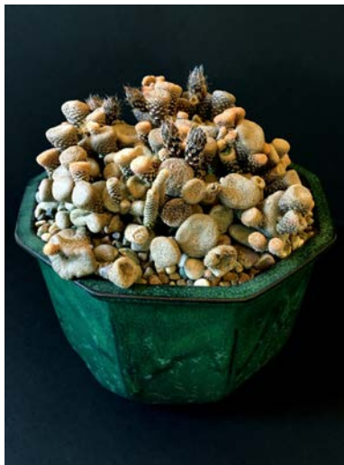
Puna chayarioides