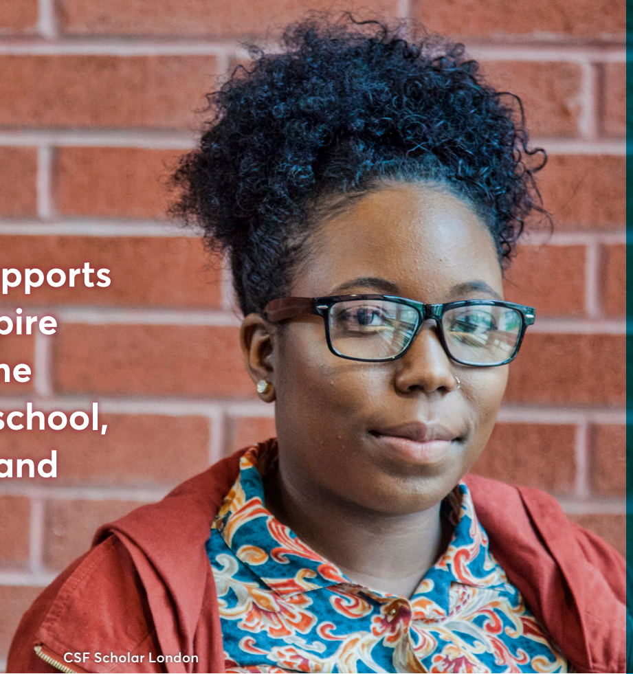
CSF Scholar London

We provide a unique integrated system of supports and scholarships to inspire underserved, low-income students to finish high school, graduate from college and succeed in life.