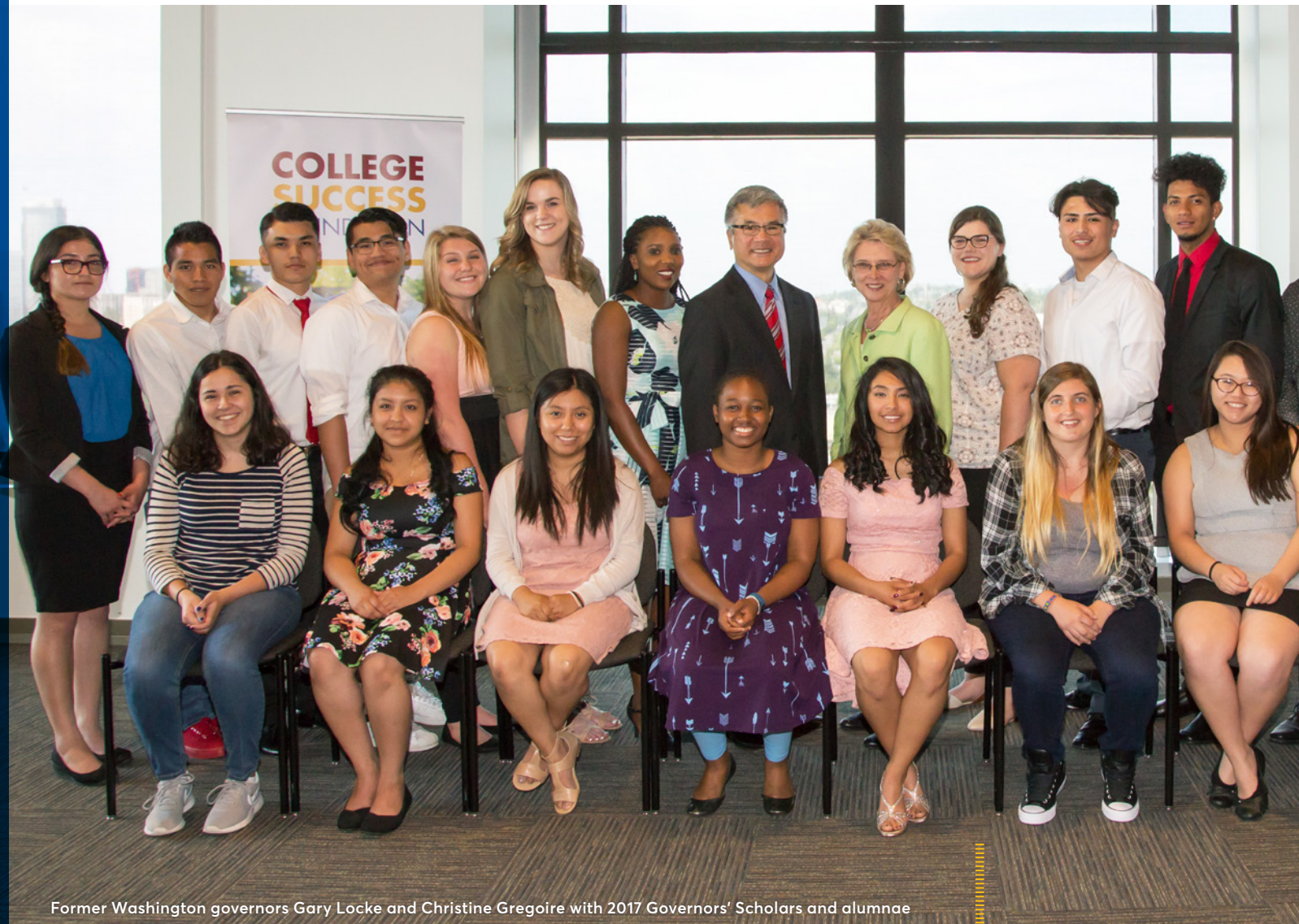
Former Washington governors Gary Locke and Christine Gregoire with 2017 Governors' Scholars and alumnae

We provide additional support for the most vulnerable student population.