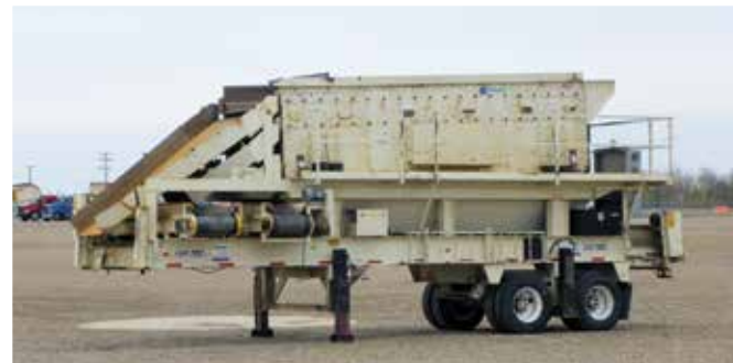
2014 KPI-JCI 6203-32