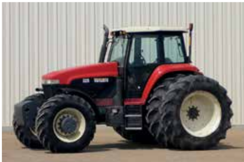
2006 Versatile 2210