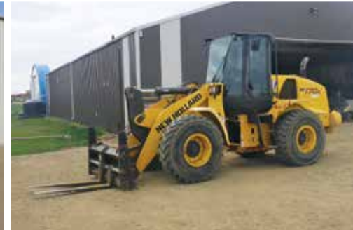
2011 New Holland W170C