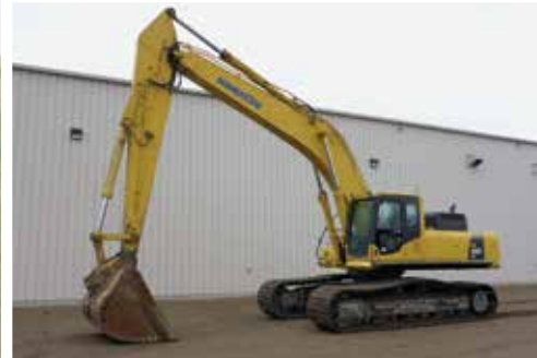
2009 Komatsu PC400LC-8