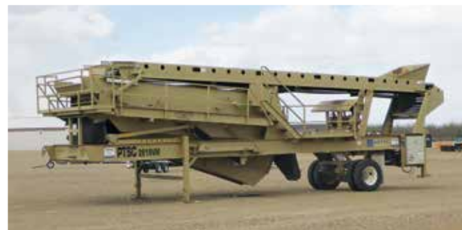
2011 Astec 2618VM