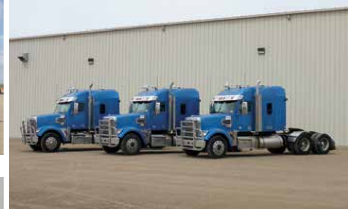
3 of 4 – 2016 Freightliner 122SD

See complete auction and equipment information on our website