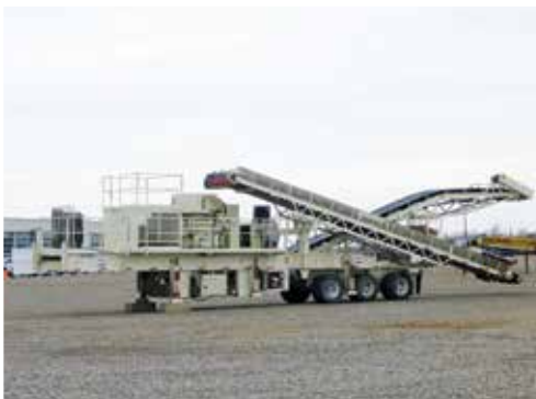
2016 KPI-JCI K300S