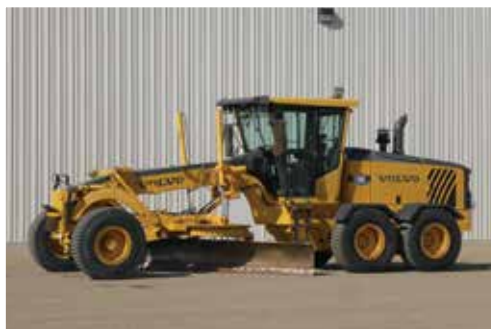
2009 Volvo G960