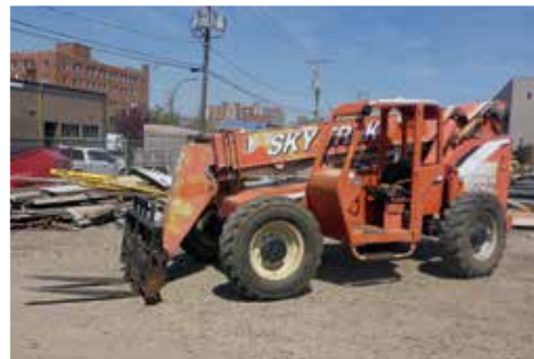
2004 Skytrak 8042