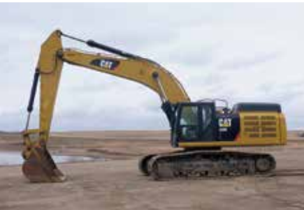
2014 Caterpillar 349EL