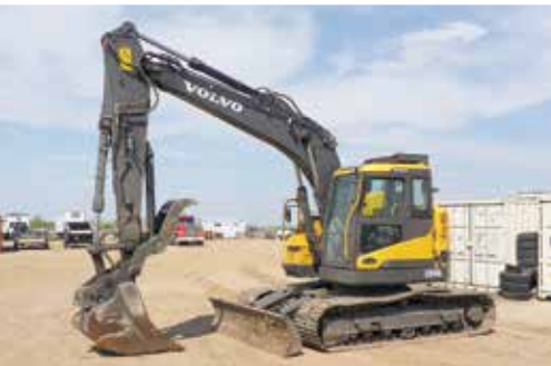
2014 Volvo EC145DL