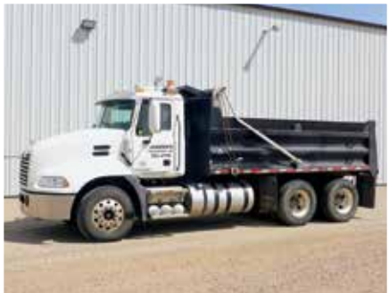
2013 Mack CXU613