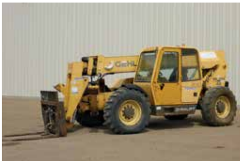
1991 Gehl DL12H 12000 Lb 4x4x4