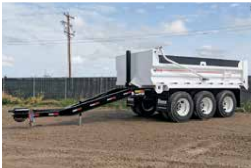
2018 Renn SL1700G1S