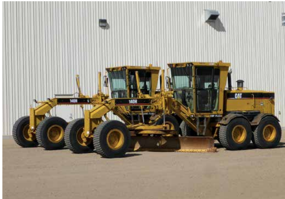
2007 & 2006 Caterpillar 140H VHP Plus