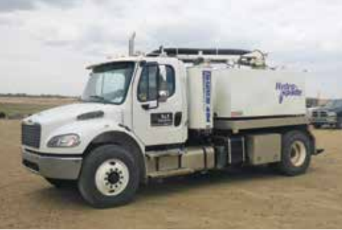
2014 Freightliner M2106