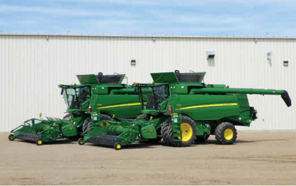
2 of 4 – John Deere T670