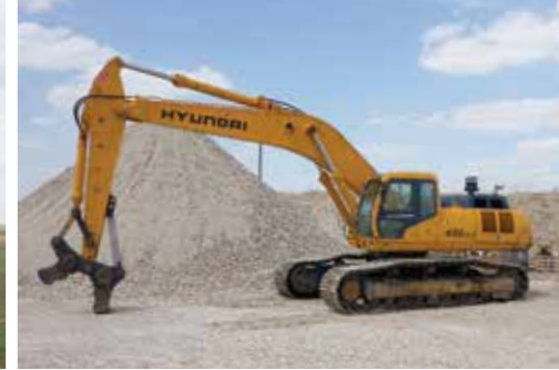
Hyundai Robex 450LC-3