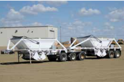
2008 Castleton Super-B