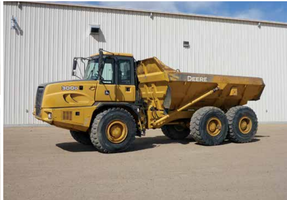
2003 John Deere 300D