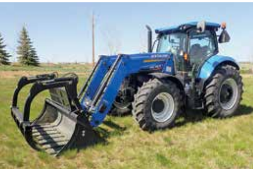
2017 New Holland T7.190