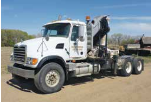
2004 Mack CV713 w/IMT 28 Ton