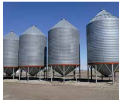
4 of 6 - Behlen 3200 Bushel