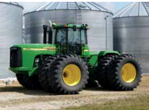
2004 John Deere 9520