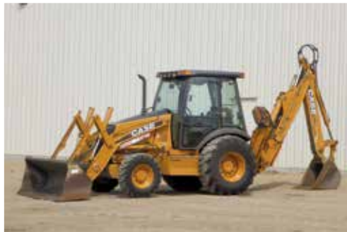
2008 Case 580 SM Series 3