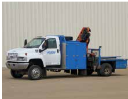
2007 GMC C5500 4x4 w/Palfinger PK7501