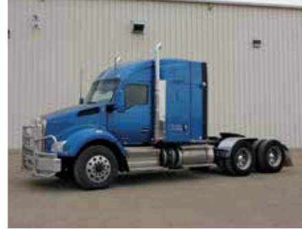
1 of 2 – 2016 Kenworth T880