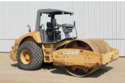
2003 Case SV212