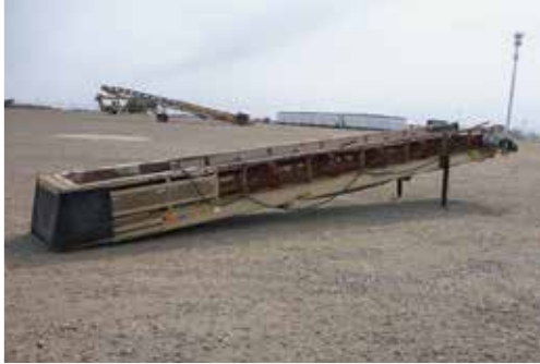
Aggregate Machinery 3030 Thunderbird II