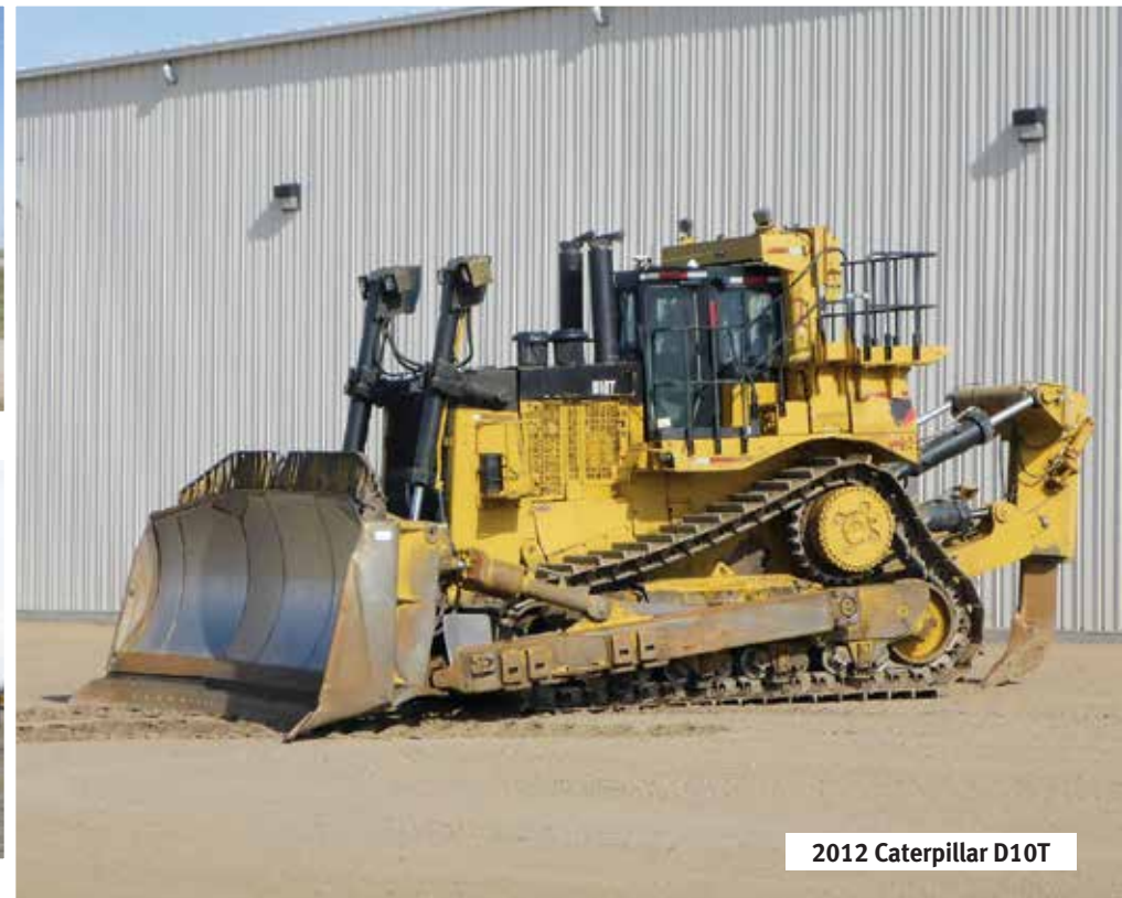
2012 Caterpillar D10T