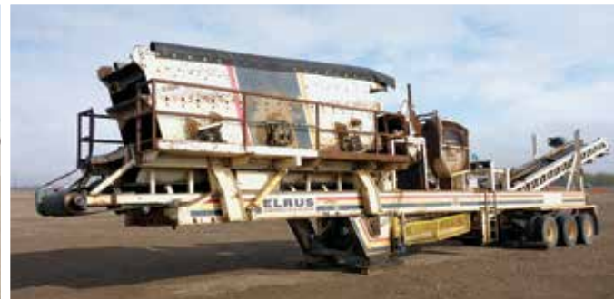
2002 Elrus 2436