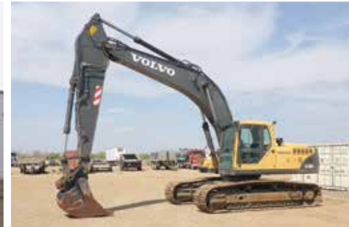
2007 Volvo EC290BLC