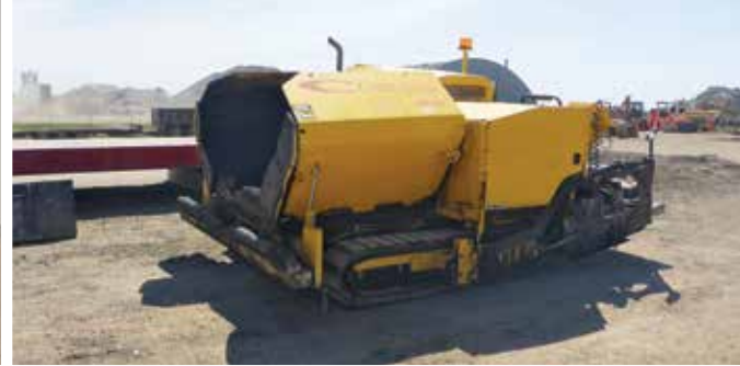
2014 Carlson CP90