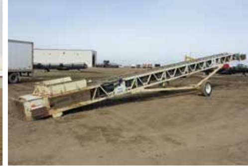
1 of 2 - Kohlberg Pioneer 47-3660 Radial