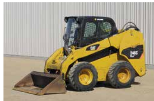
2009 Caterpillar 246C