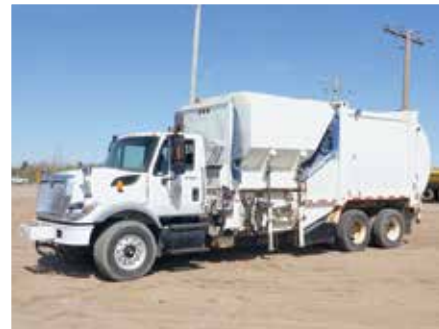
2008 International 7400