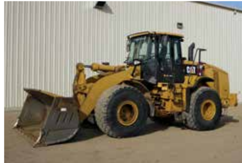
2011 Caterpillar 966H