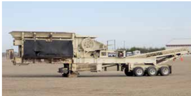
2015 Kolberg Pioneer 3155