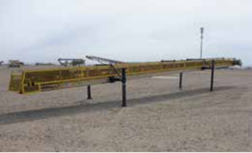
2005 Aggregate Machinery 3060CL Thunderbird II