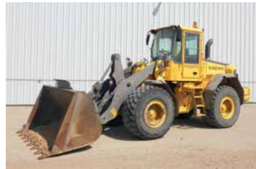
2006 Volvo L90E