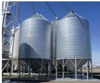
2 - Westeel 2000 Bushel