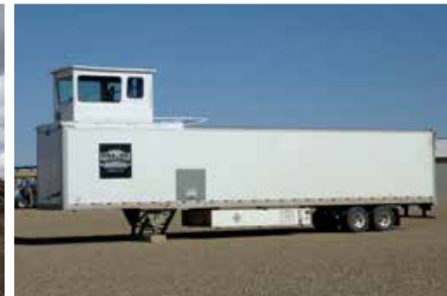
2014 Ground Works 53 Ft 500 KW