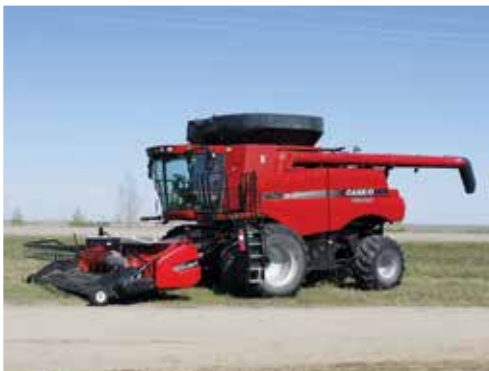
2011 Case IH 9120