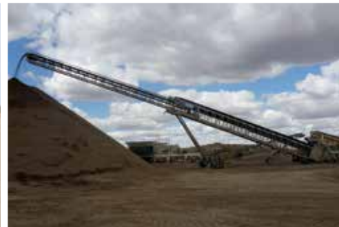
2012 KPI-JCI 33-36150 Telescopic