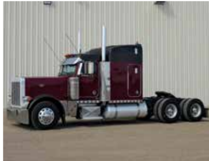
2003 Peterbilt 379