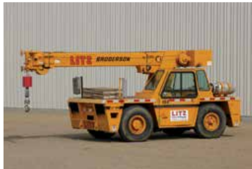
2002 Broderson IC80-3F 7 Ton 4x4x4