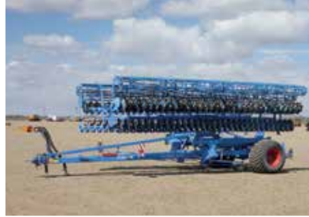
2015 Lemken Gigant 12 52 Ft