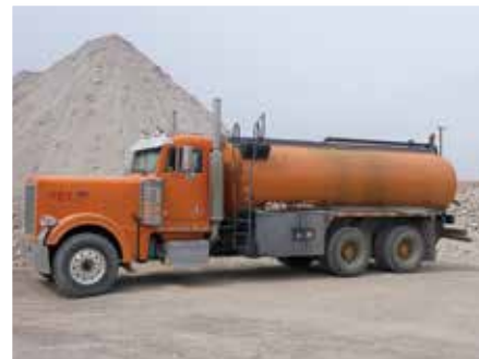
1997 Peterbilt 379L