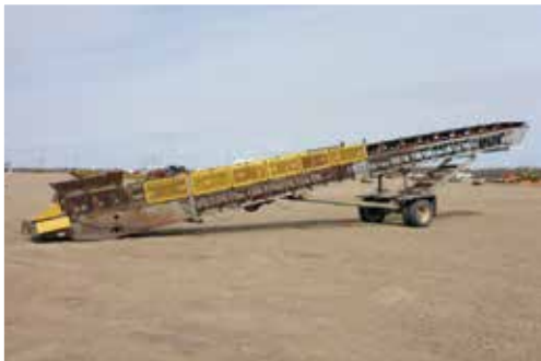
KPI-JCI 1336 36 In. x 70 Ft Stacking