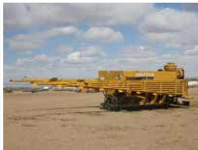
2012 Agco Soilection Four Spreader Box