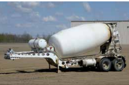
1995 McNeilus 13 Cu Yd