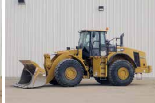
2008 Caterpillar 980H