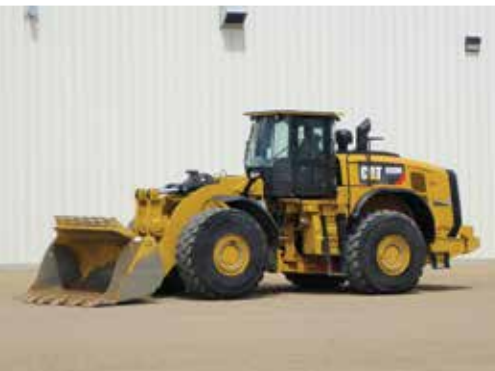
2018 Caterpillar 980M