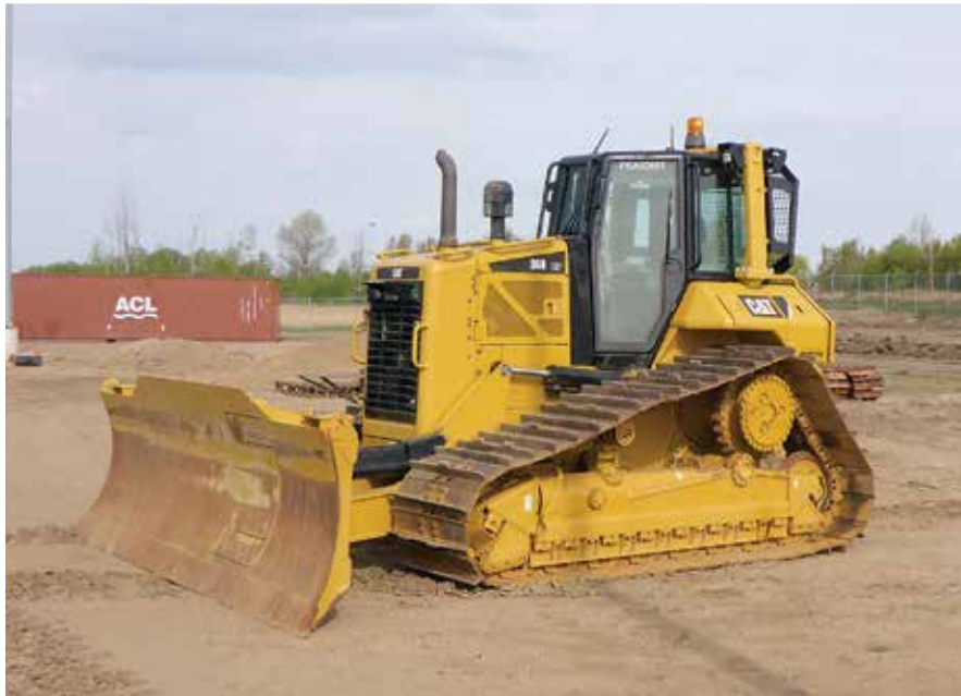
2015 Caterpillar D6N LGP