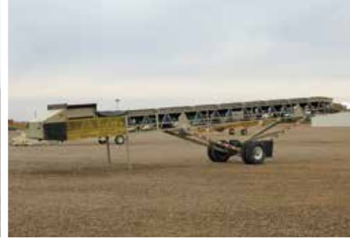
2018 Hikon 4253