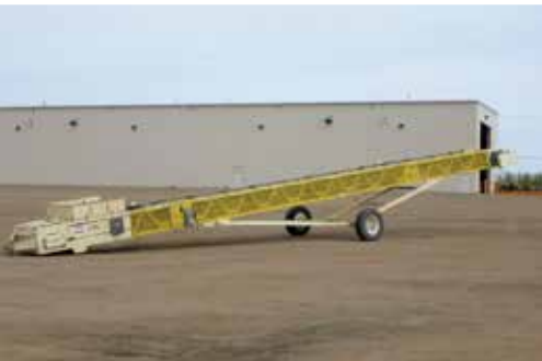
2015 KPI-JCI 47-3660 Radial