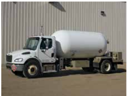
1 of 2 – 2011 Freightliner M2