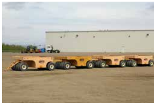
4 - WRT PT13