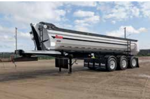
2019 Renn SL3300G2