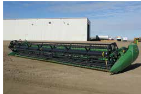
2011 John Deere 635D 35 Ft