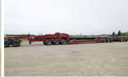
2003 Fontaine 753 3M-HES 90 Ton & 453J Booster