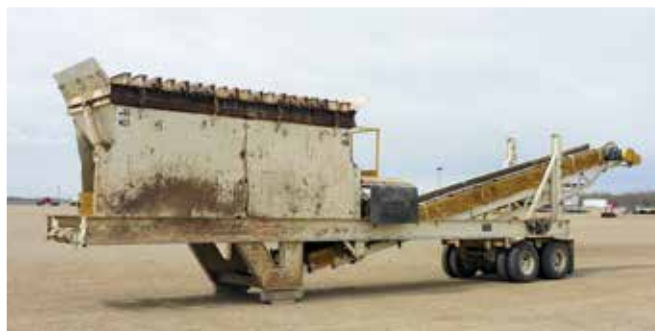
Metso 7 x 16 Ft