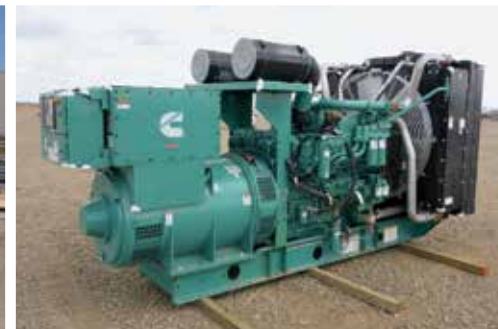
Unused - 2017 Cummins 1000 KW