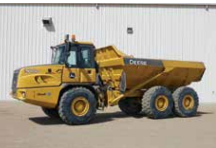
2014 John Deere 300D Series II

Equipment videos, photos, auction news and more. Like us on facebook.com/RitchieBros