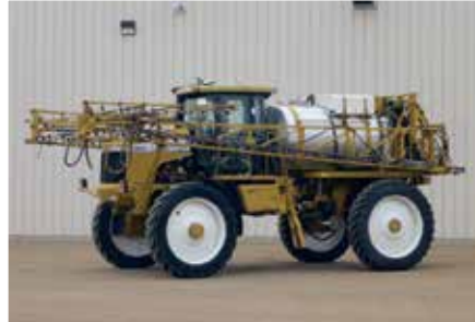
2000 Rogator 1254 90 Ft