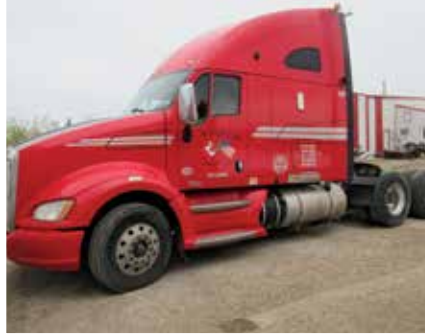
2012 Kenworth T700