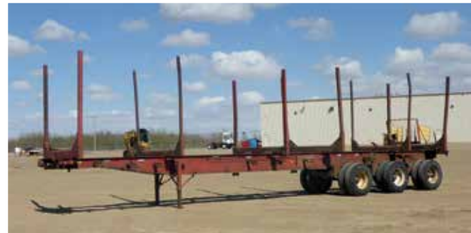
1996 Bee Line 48 Ft