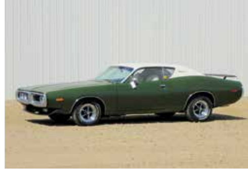
1972 Dodge Charger