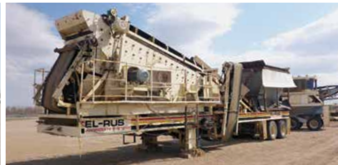
Elrus 5 x 16 Ft Triple Deck