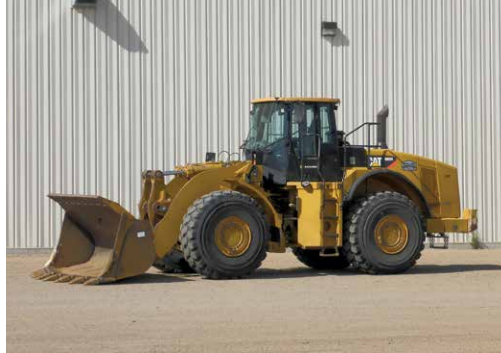
2011 Caterpillar 980H