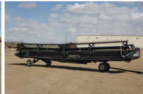
2011 MacDon FD70 40 Ft