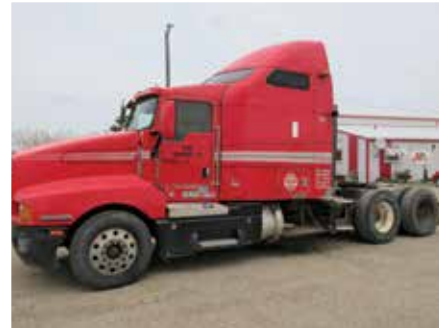
1 of 8 – Kenworth T660