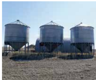
3 - Twister 4200 Bushel