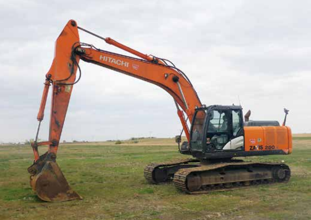
2012 Hitachi ZX250LC-5N