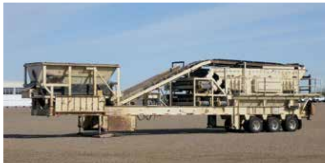
2012 KPI-JCI 7203-38LP