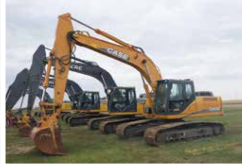
2011 Case CX250C