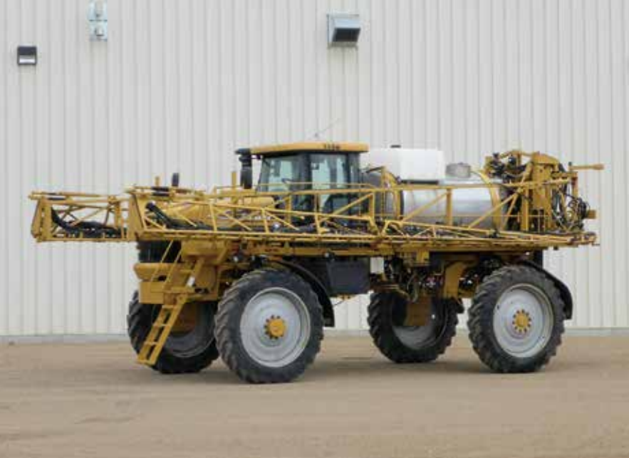
2010 Rogator 1386 120 Ft