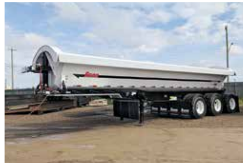
2019 Renn SLSDR