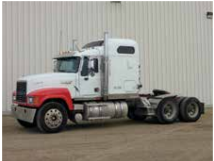
2006 Mack CHN613