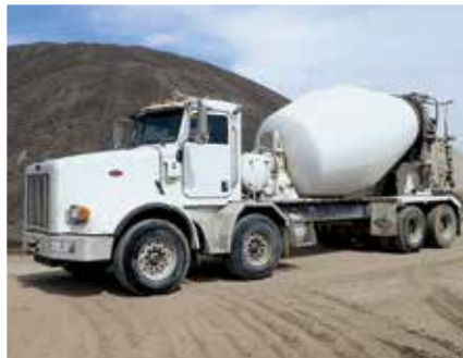
2005 Peterbilt 357