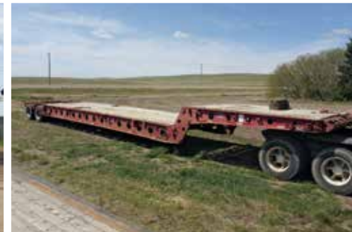
1998 Aspen 16 Wheel