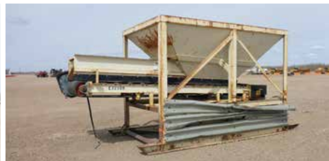
Aggregate Equipment 36X15