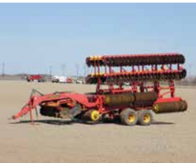
2013 Vaderstad Carrier 1225 XL 40 Ft