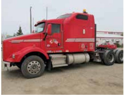
1 of 2 – 2012 Kenworth T800