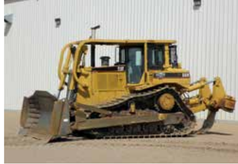
1998 Caterpillar D8R