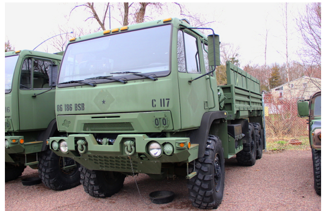
M1038 Troop Truck