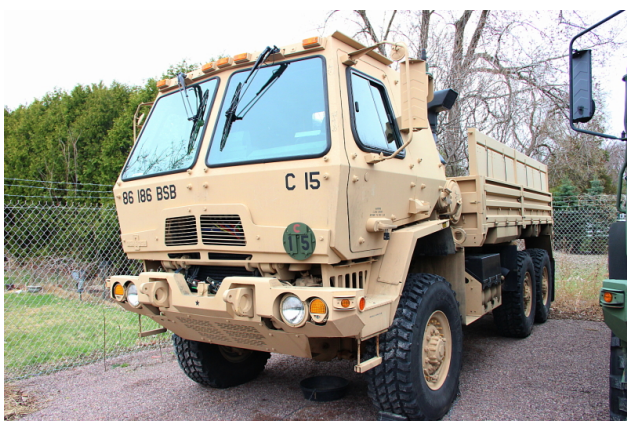
M1038 Armored Troop Truck