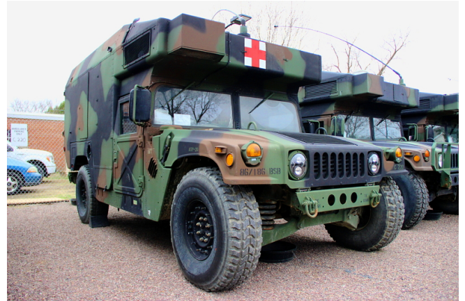
M997 Hummer Ambulance