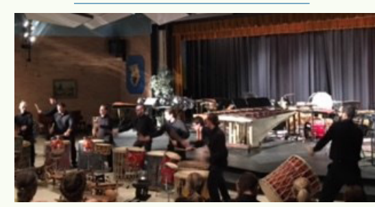
WVU Percussion Ensemble at OGHS

Naoma Drum 6/11 Bobby Lohr 6/11 Eleanor Krafft 6/28