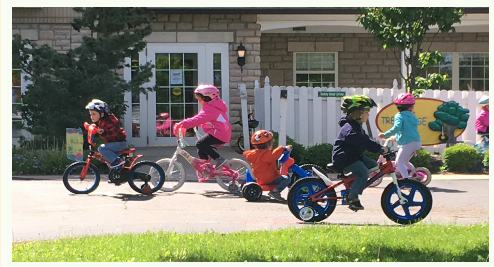
Above: The Treehouse kids participating in The St. Jude's Trike-A-Thon.

The Treehouse is very excited to be continuing the tradition of The St. Jude Trike-A-Thon. All the money goes to support the work of St. Jude's Children's Research Hospital.