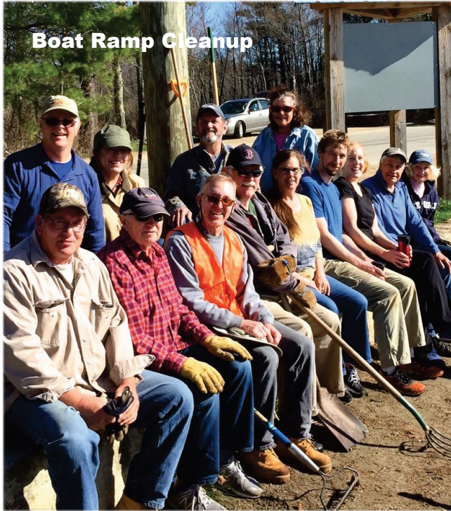
Boat Ramp Cleanup