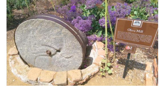
Olive Mill at Mission San Juan Capistrano