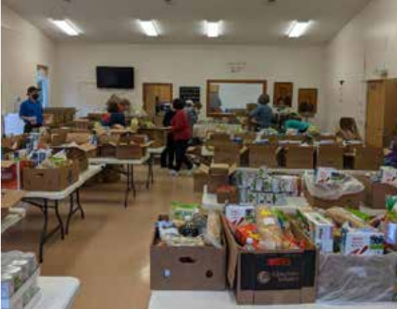
Help Peace Pres organize their food pantry!