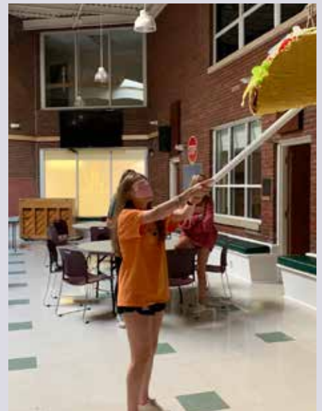
Our sophomores enjoyed a Fiesta-themed dinner with their classmates!

Be on the lookout for your Fiesta with your classmates!