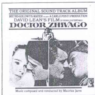
THE ORIGINAL SOUND TRACK ALBUM METRO-GOLDWYN-MAYER PRESENTS A CARLO PONTI PRODUCTION DAVID LEAN'S FILM OF BORIS PASTERNAK'S DOCTOR ZHIVAGO Music composed and conducted by Maurice Jarre