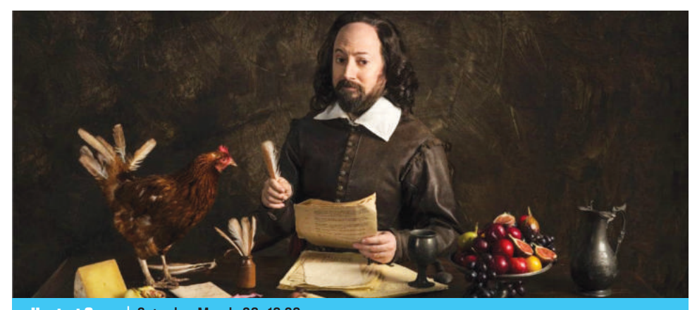
Upstart Crow | Saturday, March 30, 10:30 p.m.

In the shadow of Italy's Vesuvius, a lesser-known volcano rumbles: Campi Flegrei. An eruption could endanger the millions of residents of Naples.