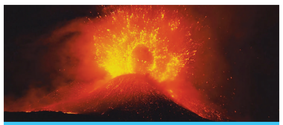
Nature: Living Volcanoes | Thursday, March 28, 6 p.m.

Uncover the variety of activity, both human and natural, that occurs on the slopes of active volcanoes.