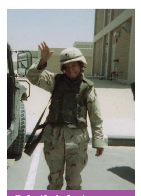
War Zone/ Comfort Zone | Monday, March 25, 7 a.m.

Explore the research behind the reasons why more women don't run for political office.