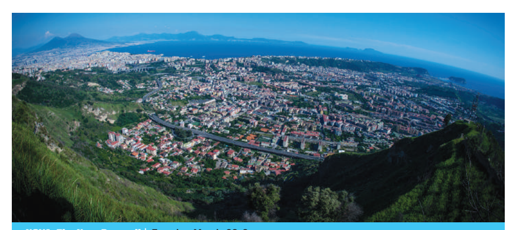
NOVA: The Next Pompeii | Tuesday, March 26, 8 p.m.

Uncover the variety of activity, both human and natural, that occurs on the slopes of active volcanoes.