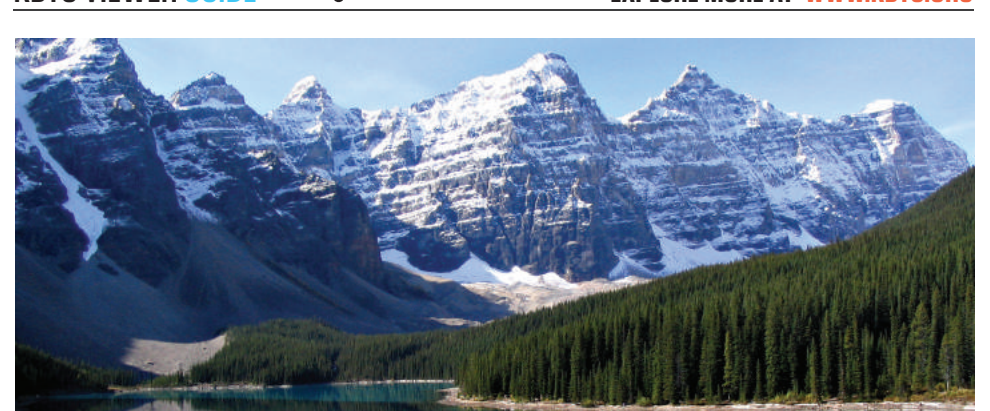
Ken Burns' National Parks: America's Best Idea | Tuesday, March 5, 8:30 p.m.

Explore the beauty and grandeur of our nation's magnificent parks, from Acadia to Yosemite, Yellowstone to the Grand Canyon. Learn the reasons why the national parks are America's best idea.