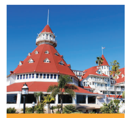
Antiques Roadshow: Hotel Del Goronado | Wednesday, March 27, 8 p.m.

Check in to Hotel del Coronado to see sensational finds at a stunning seaside setting!