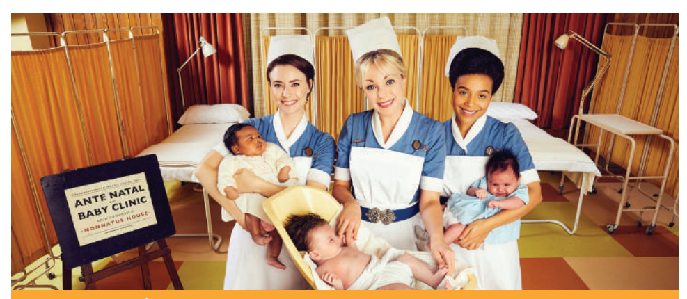
Call the Midwife | Monday, March 25, 9 p.m.

It's spring of 1964 and everyone is excited for the Queen's Royal Birth. With the additions of two new Sisters, who have been sent to live and work with the team in Poplar, Nonnatus House feels full once more.