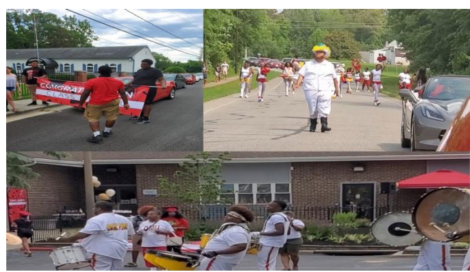
AAC Branch NAACP participated in the Freetown Village Graduation Parade to celebrate the Class of 2020

prom and graduation. Many students and community members expressed that since they were not able to participate in a formal graduation, they were happy the parade made up for the event. The AAC Branch NAACP was able to honor approximately twenty (20) graduates and offer them words of encouragement as they embarked on their next steps in life. They were also awarded with certificates to celebrate this pivotal accomplishment.