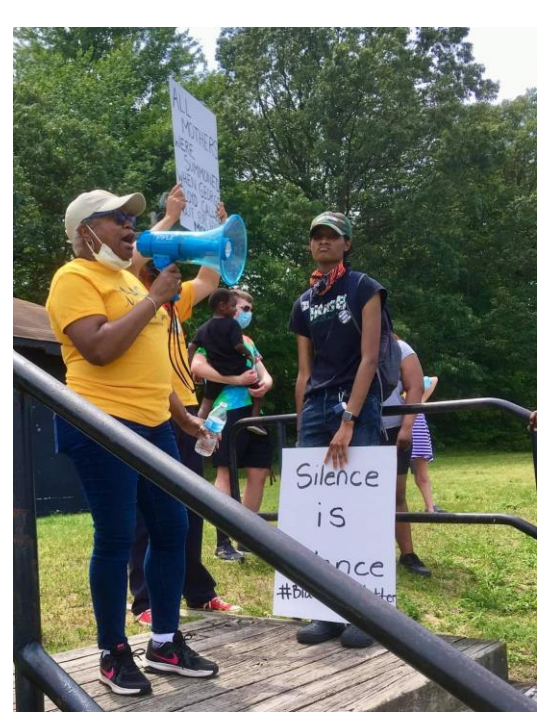
Summer 2020 – Black Lives Matter Protest

We will not stop until there is real police and judicial reform!