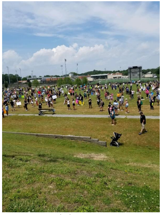
Summer 2020 - Black Lives Matter Protest

protests for Black Lives Matter in the summer of 2020. Our branch will continue to support the movement that Black Lives Matter and these important protests!