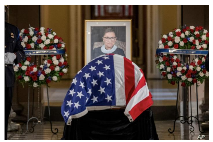
The late Justice Ruth Bader Ginsburg lies in State at the U.S. Capitol, September 25, 2020.

We are saddened to learn of the passing of U.S. Supreme Court Justice Ruth Bader Ginsburg. She was an American icon who transformed laws and policies for the betterment of society.