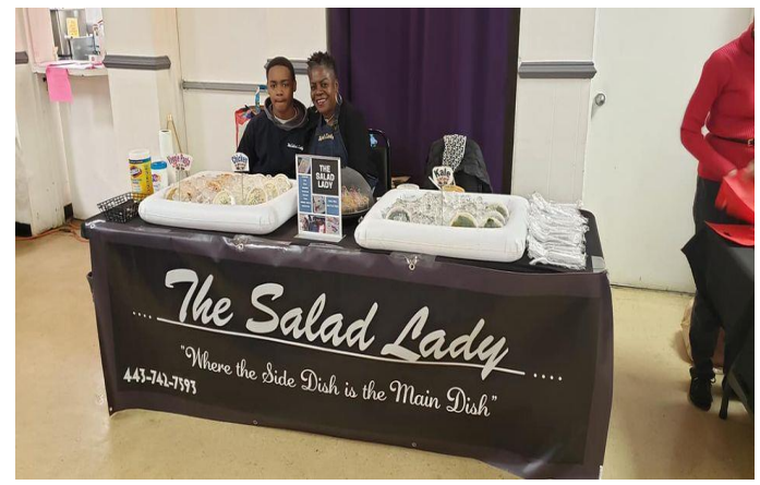
Pictured above, the vendor, The Salad Lady participating in event.

The attendees also enjoyed a night of physical activities that included line dancing and hand dancing lessons.