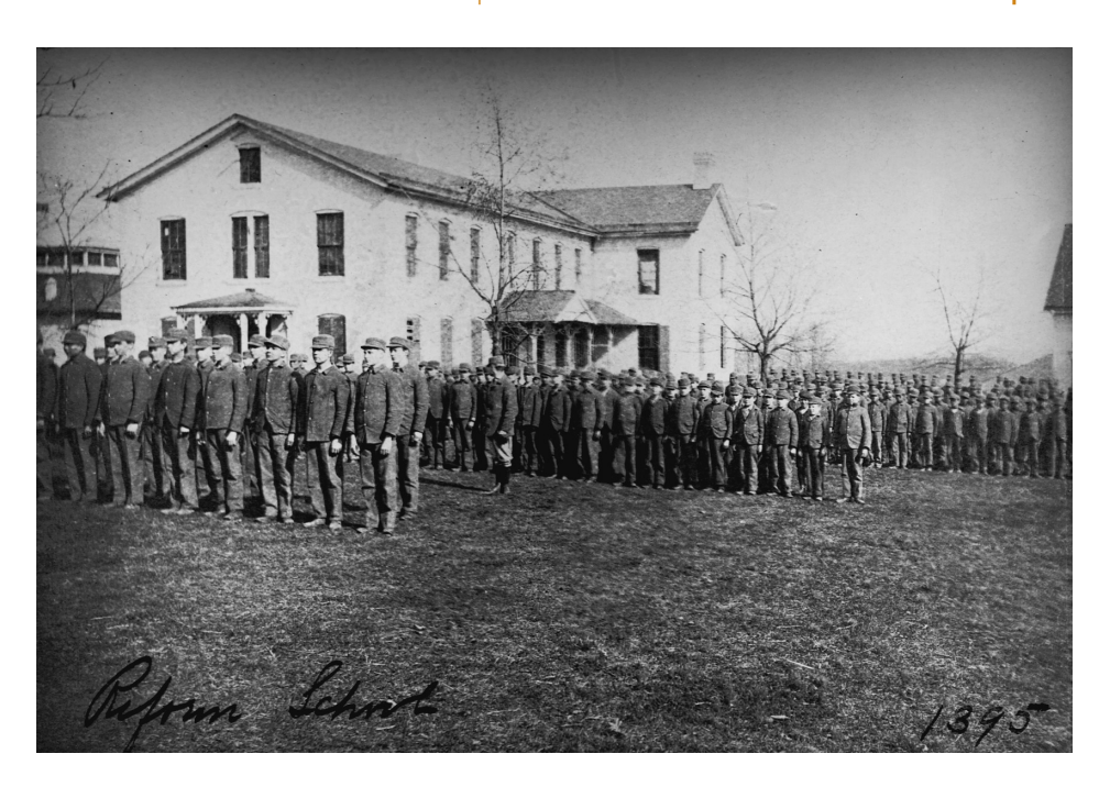
▲ Life in the reform schools of the 19th century was not easy.

cases involving children who had violated the law or were neglected, dependent, or otherwise in need of intervention or supervision. This philosophy changed the nature of the relationship between juveniles and the state by recognizing that juveniles were not simply miniature adults but rather children who could perhaps be served best through education and treatment. By 1917, juvenile court legislation had been passed in all but three states, and by 1932 there were more than 600 independent juvenile courts in the United States. By 1945, all states had passed legislation creating separate juvenile courts.