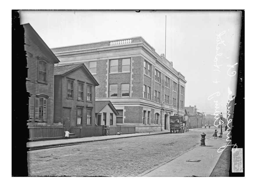
▲ The Juvenile Court Building, at Ewing and Halsted in Chicago in 1907, is shown. As noted in this chapter, the first family court in the United States was in Cook County, Illinois.

The juvenile court was supposed to have provided due process protections along with care, treatment, and rehabilitation for juveniles while protecting society. Yet there is increasing doubt as to whether the juvenile justice network can meet any of these goals. Violence committed by juveniles, which some suggest occurs in cycles (Johnson, 2006b), has again attracted nationwide attention and raised a host of questions concerning the juvenile court, even though such violence had actually declined significantly during the prior decade. Can a court designed to protect and care for juveniles deal successfully with those who, seemingly without reason, kill their peers and parents? Is the juvenile justice network too "soft" in its dealings with such juveniles? Isn't the "get tough" approach adopted over the past two decades what is needed to deal with violent adolescents? Was the juvenile court really designed to deal with the types of offenders we see today?