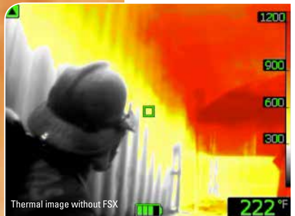
Thermal image without FSX