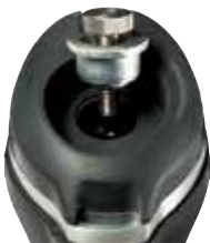
The FLIR K65 camera connectors (left) are fully sealed and the battery (right) can be fixed inside the camera with a screw.