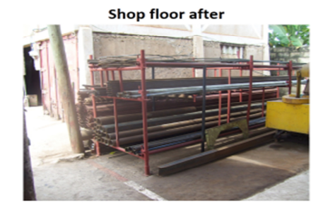
Exterior appearance of the enterprise before 5S-KAIZEN