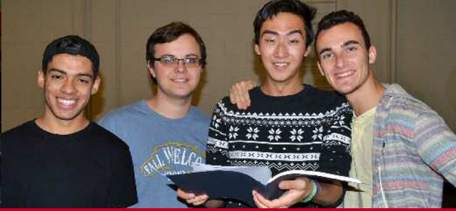
SHREK, THE MUSICAL IN REHEARSAL