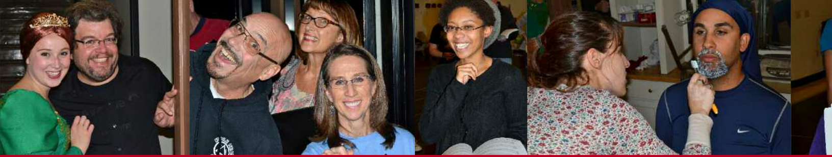
SHREK, THE MUSICAL PHOTO SHOOT