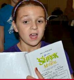
SHREK, THE MUSICAL IN REHEARSAL