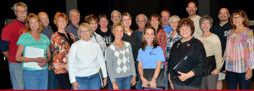
GRAND OLE MUSIC IN REHEARSAL