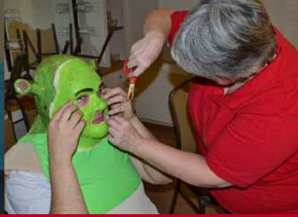
SHREK, THE MUSICAL PHOTO SHOOT