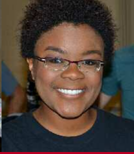
SHREK, THE MUSICAL IN REHEARSAL