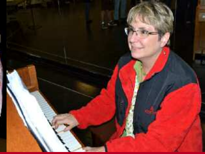
SHREK, THE MUSICAL IN REHEARSAL