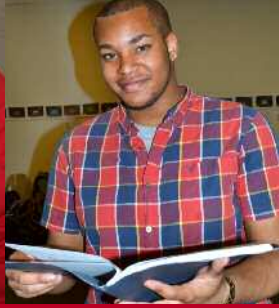
SHREK, THE MUSICAL IN REHEARSAL