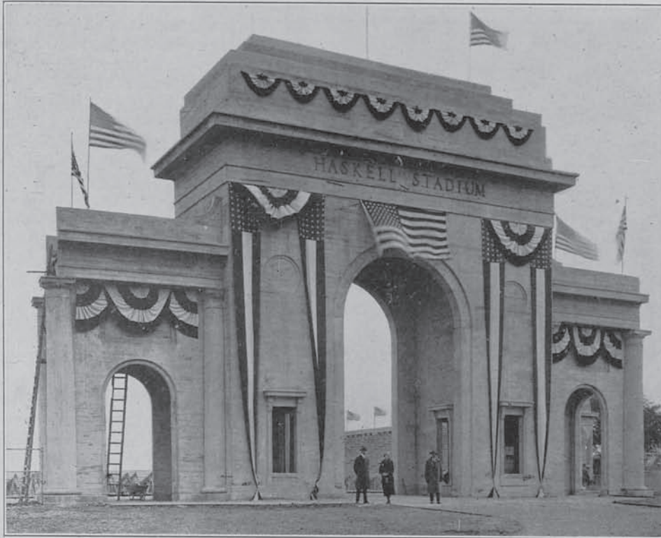
ENTRANCE, HASKELL STADIUM