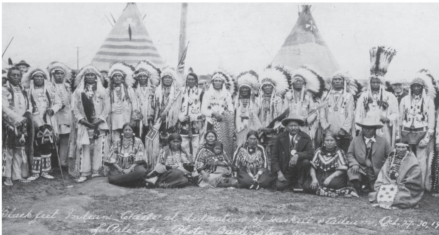
When the weekend of October 27–30, 1926, finally arrived, all “Indian trails” did seem to lead to Lawrence as seventy tribal representatives gathered for the four-day celebration. The festivities included the main event—the dedication of the football stadium—but also an intertribal powwow, contests, parades, and a football game.