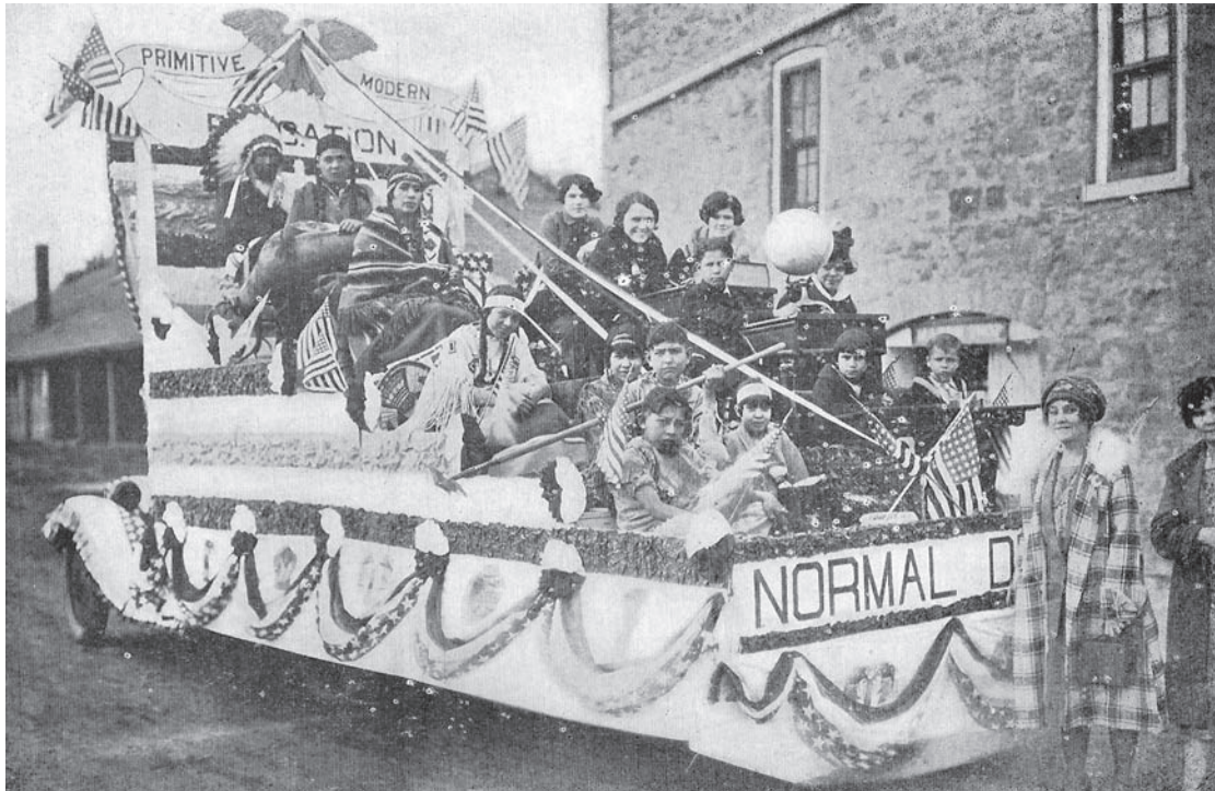
A twenty-float parade, which traveled from Haskell through downtown Lawrence, deliberately and visually contrasted Haskell students with their Native American visitors. Floats exhibited the unique training received by students and in this example depicted education as the difference between the "primitive" and the "modern" Indian. Illustration from The Indian Leader , special celebration issue, courtesy of Haskell Cultural Center and Museum, Lawrence, Kansas.

parade, as did the Haskell band, which the press, perhaps overzealously, called the "largest band in the world." 33