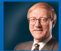
Dr David Norton

Register today for your opportunity to become Kaplan-Norton Balanced Scorecard Certified™ – the Gold Standard in Balanced Scorecard Certification.