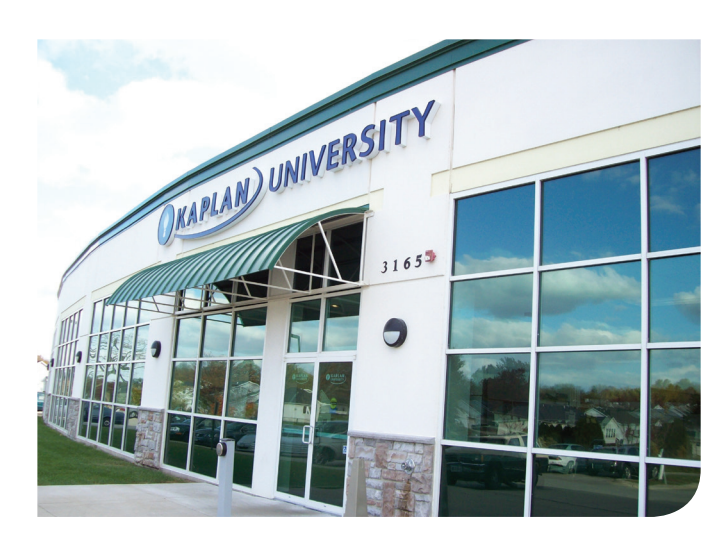
Kaplan University, Cedar Rapids, campus

Our guiding theme, "Time," forces us to think about how we interact with students, how we construct and manage internal processes, how we design and deliver our courses, and even how we approach our own daily work. It will be, in a sense, our yardstick in our assessment of success in achievement of the strategies outlined in this Plan.