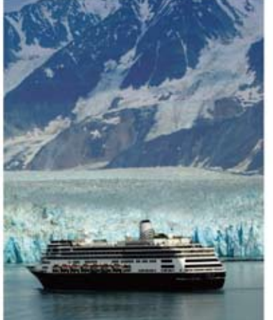
11 DAYS | AUGUST 29, 2018