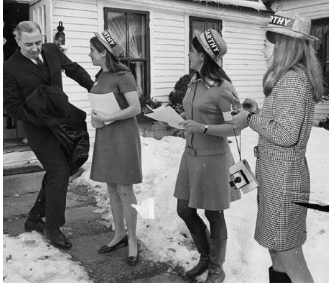
McCarthy volunteers greet their candidate.