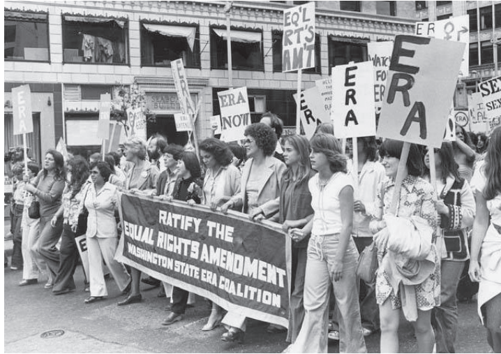
ERA demonstrators march through Seattle in 1978.