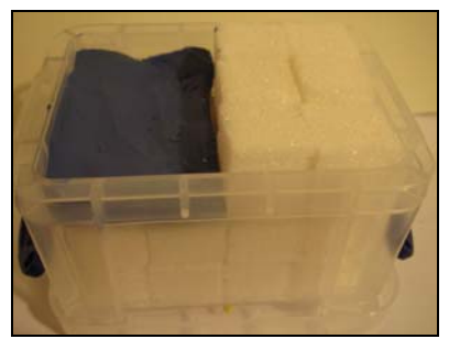
Sugar karst model of fault