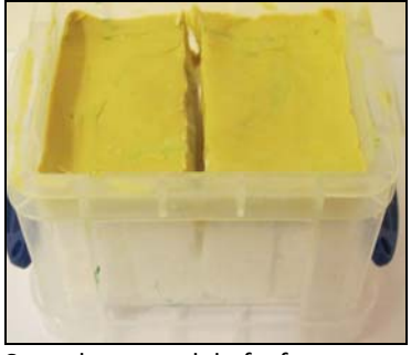
Sugar karst model of a fracture.

Students work in teams (of 4-5 students) to build sugar karst models to observe karst formation. Designate students into groups and instruct them to build a feature of the recharge zone to model and observe how fractures, faults, and sinkholes affect groundwater transport. Use student sheet. Circulate from group to group and ask students questions to assess understanding. Have students present their models and key findings to the other groups.