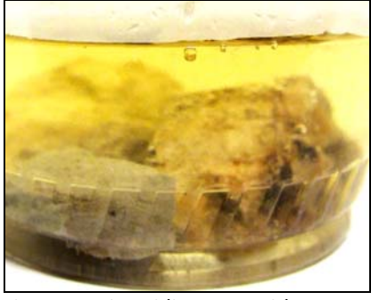
Limestone in acidic water with BTB starts out yellow