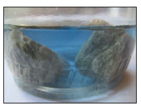
The water will eventually turn blue to indicate basic pH