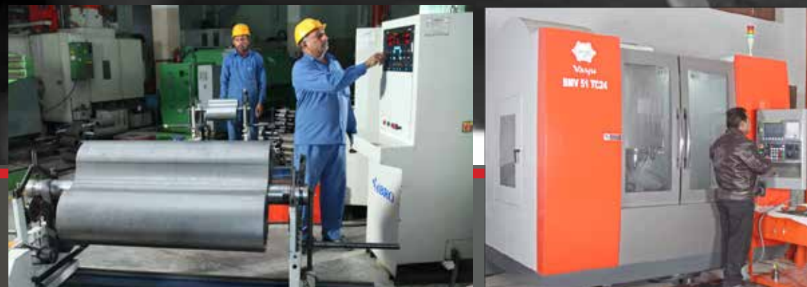
All blowers components are being machined on state-of-the-art latest CNC machines

BEARINGS- Heavy Duty spherical roller bearings, double row for maximum loading. The bearings are held in machined cartridges. Gears and bearings are fixed axially against shaft shoulder to control thrust load and maintain end clearance.