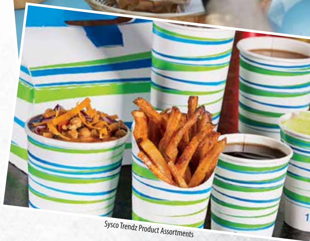
Sysco Trendz Product Assortments