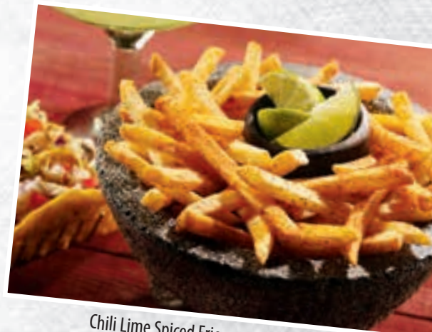
Chili Lime Spiced Fries served to theme