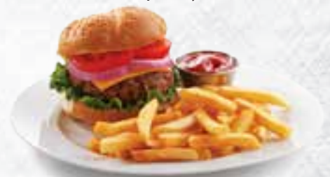
Line Flow Fries

Line flow fries may cost less, but it takes more of them to fill the plate, which actually costs operators more to buy the cheaper fry.