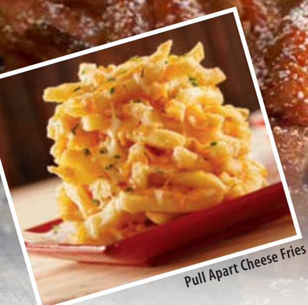
Pull Apart Cheese Fries