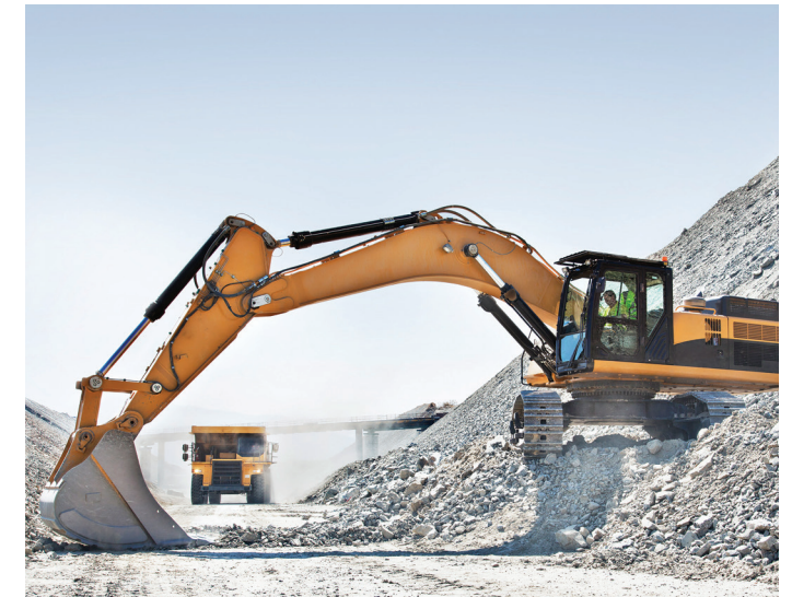
Example of hydraulics in a harsh environment; mining excavator and haul truck

cases, more than one fluid may be suitable but using a fluid other than in accordance with the manufacturer's recommendations may affect warranties. In such cases, it is sensible to consult the manufacturer and a technical specialist before making a decision.