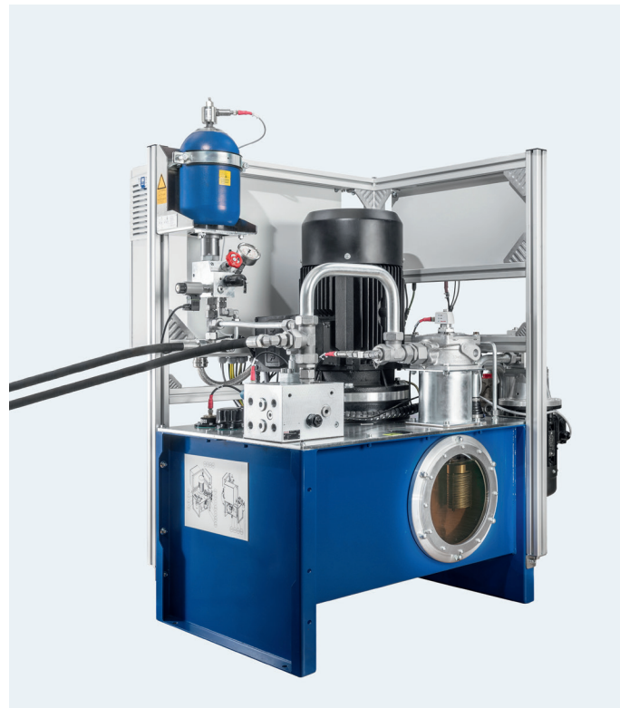
Bosch Rexroth ABPAC modular power unit

fluids, both in theory meeting these minimum requirements, one could cause significant damage to equipment after as few as 100 operating hours, while the other could create no ill-effects at all, even after 500 hours of operation.