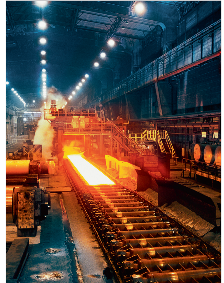
Example of hydraulics in harsh environments; Steelworks hot rolling mill

In short, hydraulic fluid not only powers a hydraulic system, but also protects and sustains it – but the extent to which it achieves these may vary hugely according to fluid choice, as we shall see. With hydraulic machinery operating within increasingly demanding specifications and environments, choosing the right hydraulic fluid is perhaps more important now than ever. In this white paper we will find out why that is, and examine the factors involved in choosing the best hydraulic fluid.