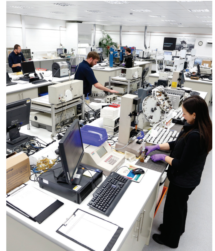
Oil analysis laboratory.

In a similar way, oil awaiting use must be stored correctly to avoid contamination and loss of quality. If water is allowed to contaminate the oil, it can reduce the oil's life and performance – the same is true of other contaminants, including air, so oil in storage must be protected, and sampled regularly to make sure it has not been inadvertently damaged.