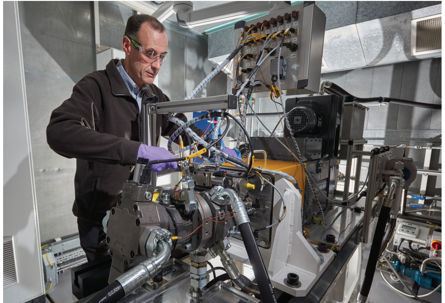
Test engineer on fluid test rig incorporating Bosch Rexroth pump and motor.

Modern hydraulic fluids can have all of these properties, but not all fluids on the market perform as well as each other, so operators and manufacturers need to look beyond the information on the packaging and delve more deeply into product qualities.