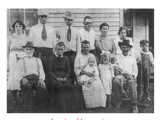
regular size / large size

It also could mean 2) a cleaner, from German, keren, 'to sweep'.