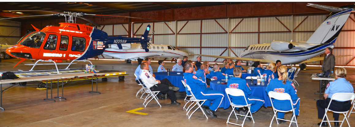
The Safety Drive was attended by the entire MedEvac 1 Flight Team, pilots, mechanics, and Kern County Firefighters from Station 62.

Care Transport, spoke about the program's safety culture and how it has grown over the years since the Company first acquired the helicopter program in 2001. When the program first started, every-