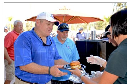
Outback Steakhouse provided golfers with a delicious lunch in advance of the "Siren" start.

Cindy Elbert Insurance Services sponsored the Hole in One competition which