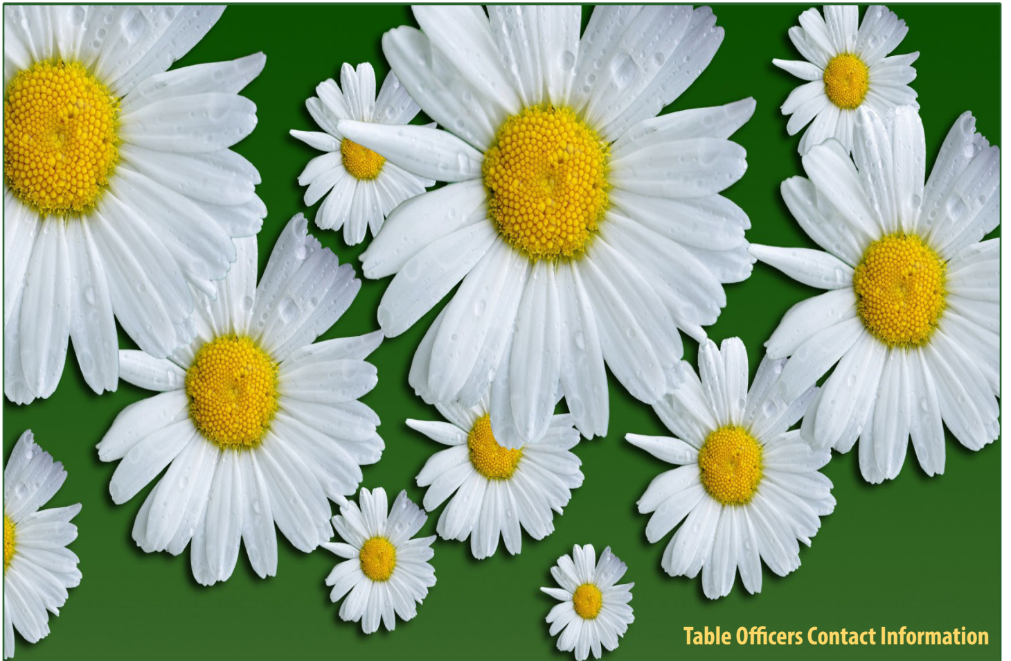
Table Officers Contact Information