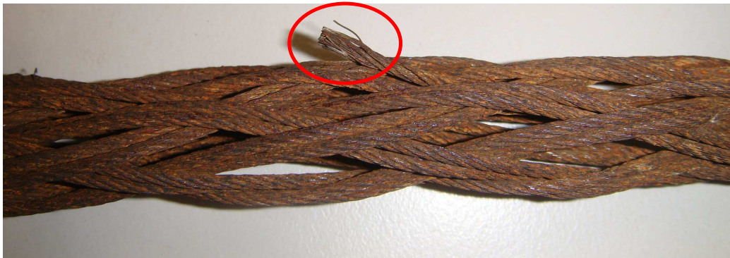
Strand of the metal whip-restraints broken which can cause injury to personnel