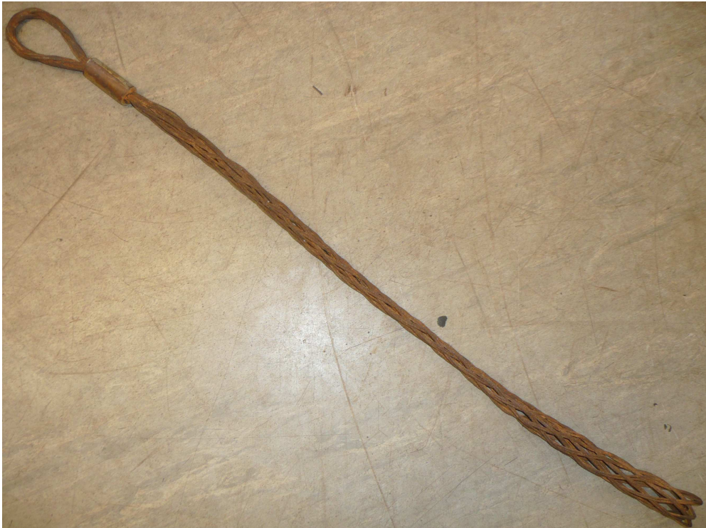
A metal whip-restraint.

Moranbah North is looking at fully integrating the Kevlar whips onto all of the longwall chock hoses.