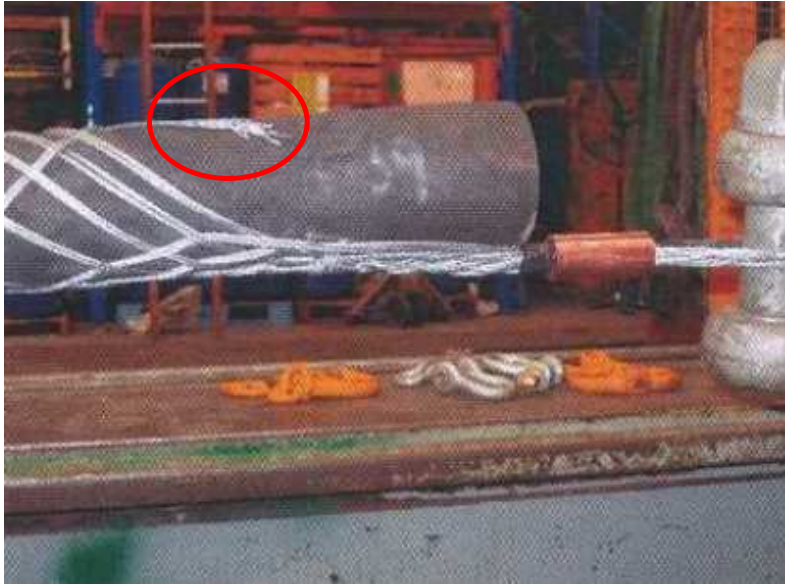
Entire strand on the metal whip-restraint failing, which can cause injury to personnel.