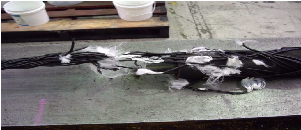
Kevlar whip-restraint at breaking point – note the fibres are easily seen when the Kevlar whip-restraint is broken, nor do the fibres result in injury to personnel