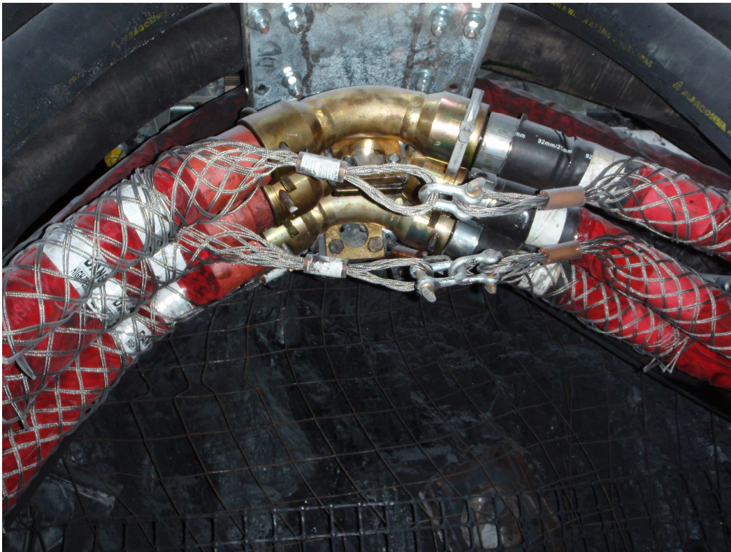
Metal whip-restraints in use on the monorail of the longwall