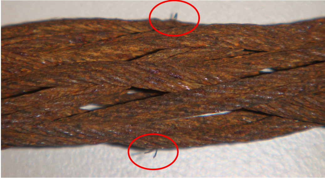
Individual wire strands broken on metal whip-restraints - can cause injury to personnel