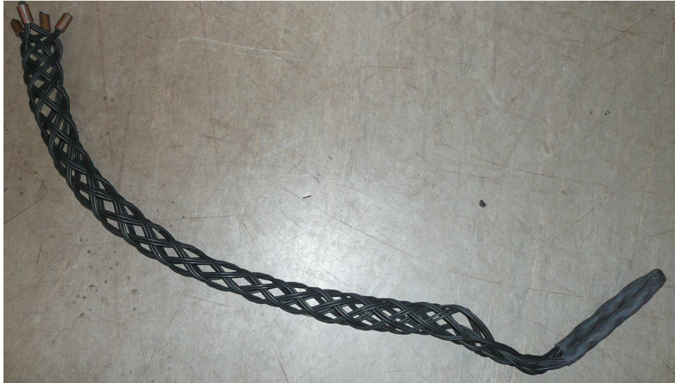
Single eye Kevlar whip-restraint