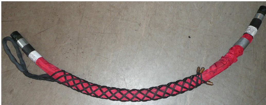
Single eye 2 ply Kevlar whip-restraint on a 1 inch hose