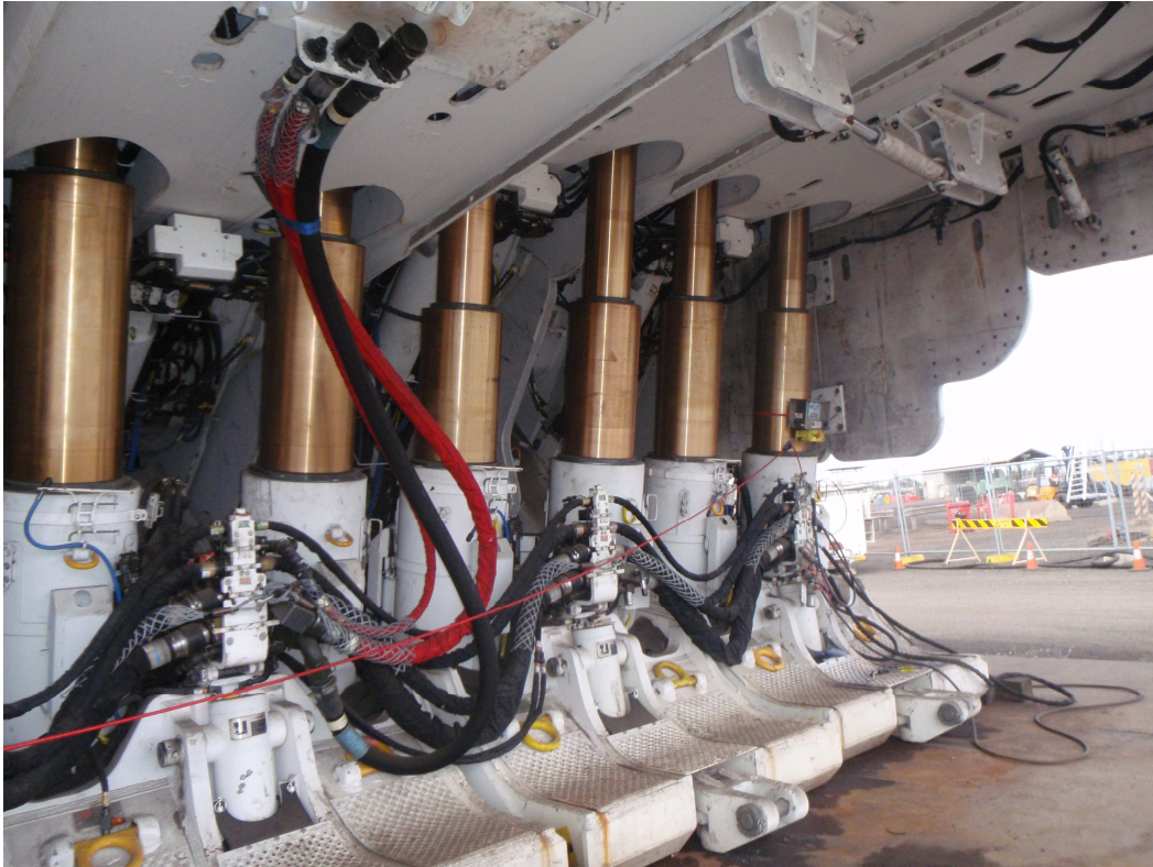
Whip-restraints located on the longwall chock hoses.